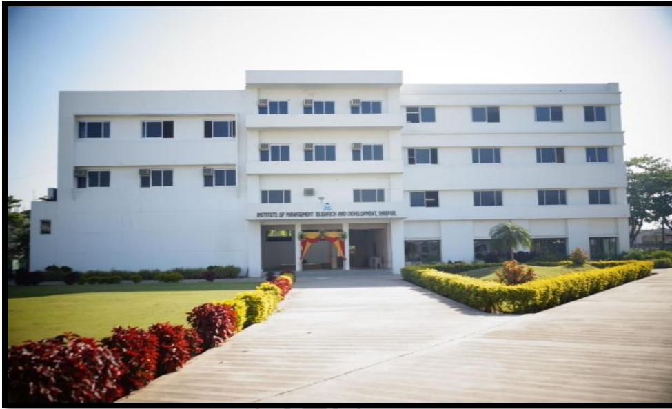
Green landscaping with trees