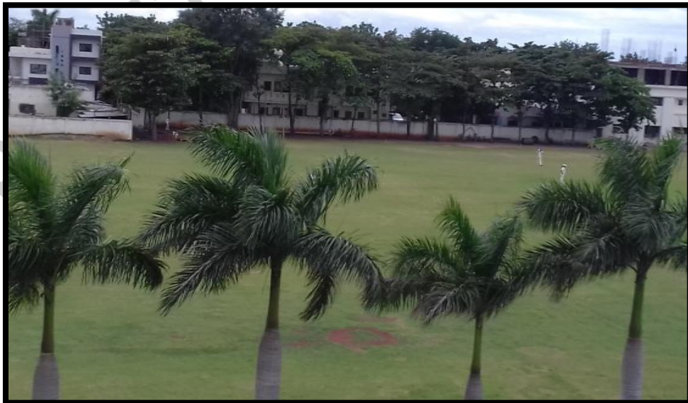
Green landscaping with trees