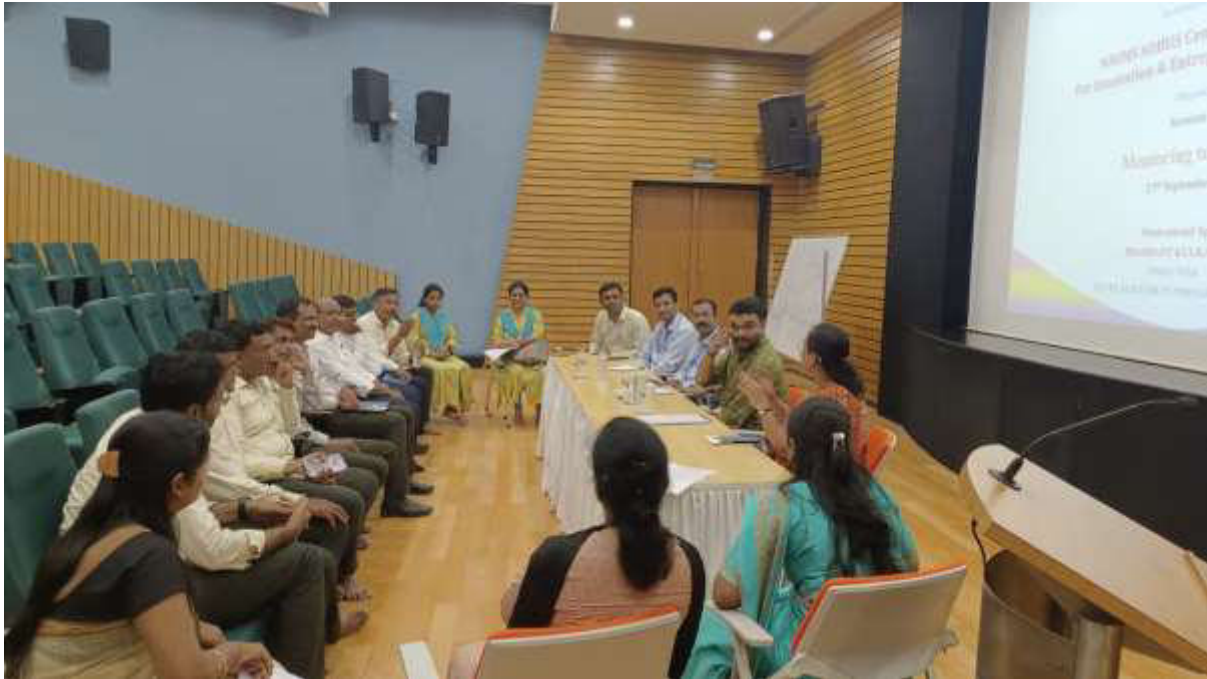
Faculties sharing their experiences and insights

Concluding Remark: - The interaction between the audience and the resource person made the session highly productive. Participants were greatly inspired, finding the session instrumental in gaining a comprehensive understanding of mentorship roles and responsibilities. Additionally, they explored strategies for setting goals and creating action plans to effectively guide mentees toward success.