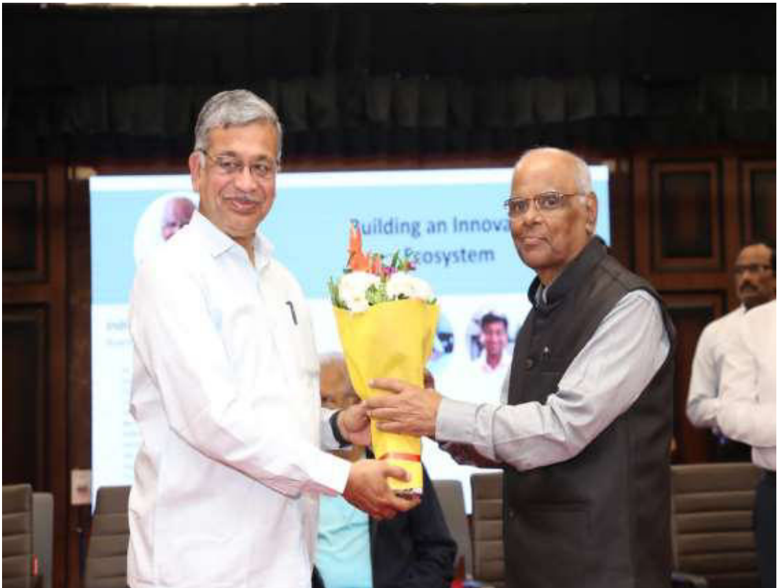
Hon. Rajgopalaji Bhandari doing Felicitation of Guests.

The outcomes of the panel discussions are expected to lay the groundwork for future initiatives, projects, or partnerships that can positively impact the economic and entrepreneurial landscape of Shirpur.