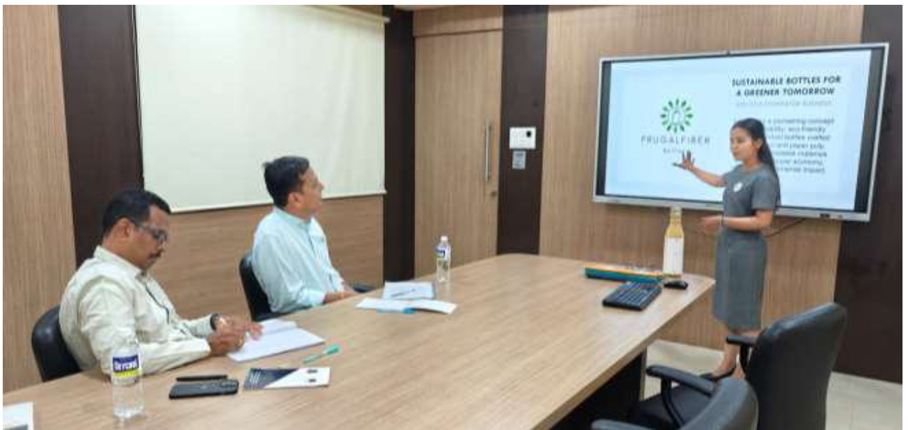
Question and Answer session during presentation.