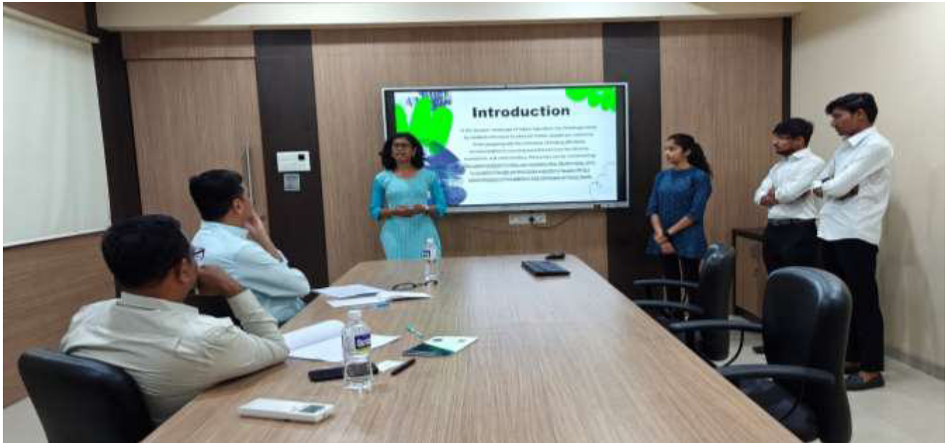
Business Idea Presentation by team in front of Judges