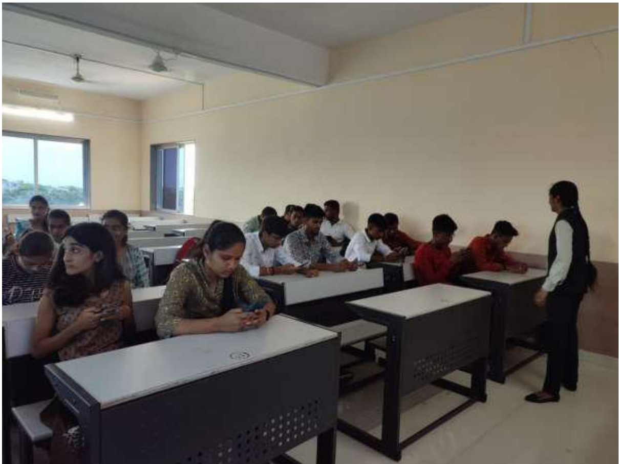
"In the Digital Arena of Entrepreneurship: E- Quiz Champions in the Making! 📱 ⌚ #FutureEntrepreneurs"