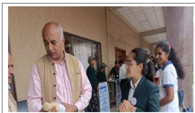
Guest visiting to the innovative ideas, poster and models.