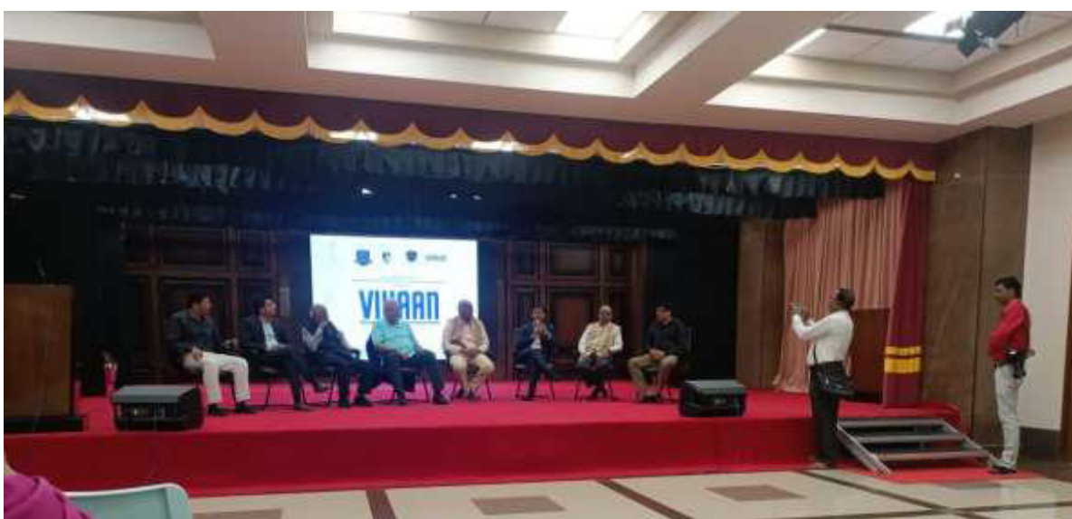
Panel Discussion at VIHAAN to trigger entrepreneurship development in Shirpur.