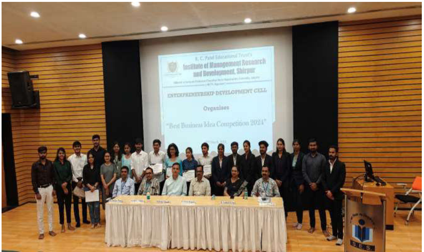
Participants in BI to BI 2024 (Phase III)

The students demonstrated enthusiastic participation in the competition, and the ideas presented by all teams were exceptionally innovative. The judges commended the teams for their efforts, presentations, and responses to questions.