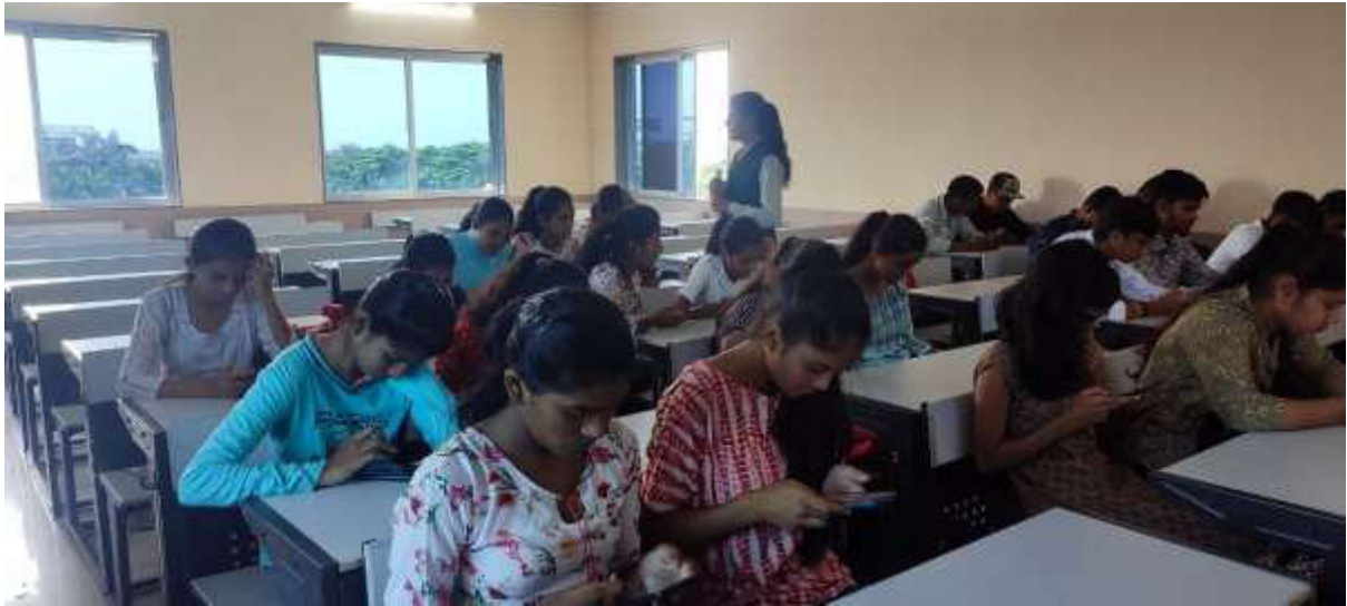
Students are engaged in attempting Entrepreneurship Development E- Quiz