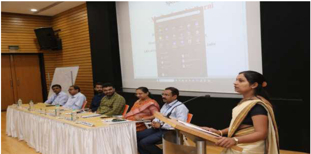
"Prominent figures gathered as distinguished guests for the insightful workshop."

Concluding Remark: - The workshop was fruitful considering the interaction between audiences and resource person. The participants were highly motivated by the session. The workshop was useful to develop entrepreneurial mindset with winning attitude.