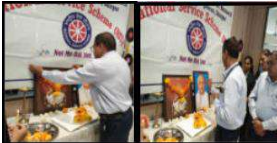
Honouring the Legacies of Sardar Patel and Indira Gandhi