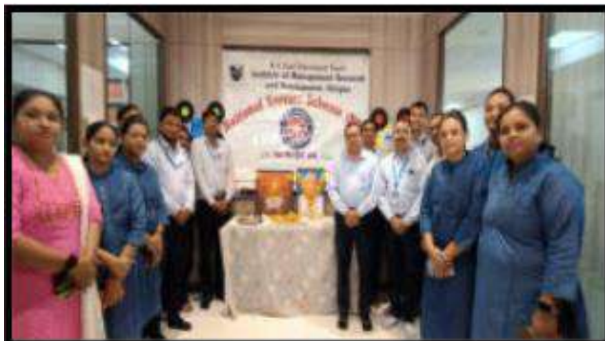
A Day of Tribute: Sardar Patel and Indira Gandhi's Birth Anniversaries by all faculty members.