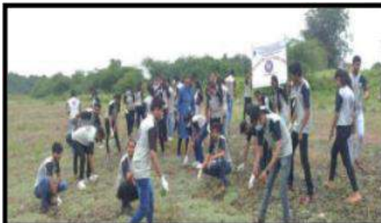
Cleanliness on the River bank initiative

The Director, Assistant Director, IQAC coordinator, HoD UG, staff, NSS volunteers, and students actively participated. The campaign involved cleaning and proper disposal of collected garbage.