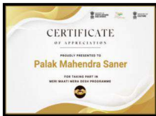
Certificates of Participation