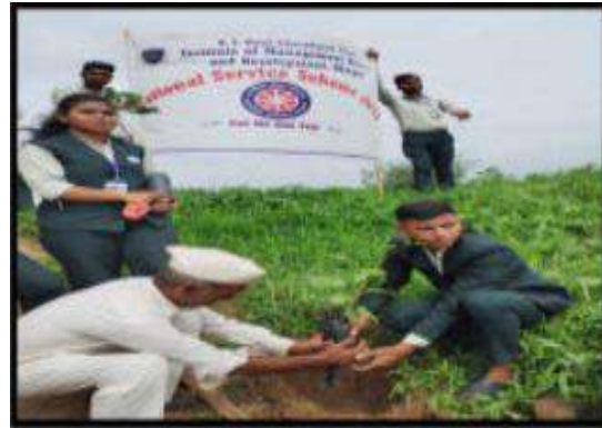
Tree Plantation by a local villager & volunteers