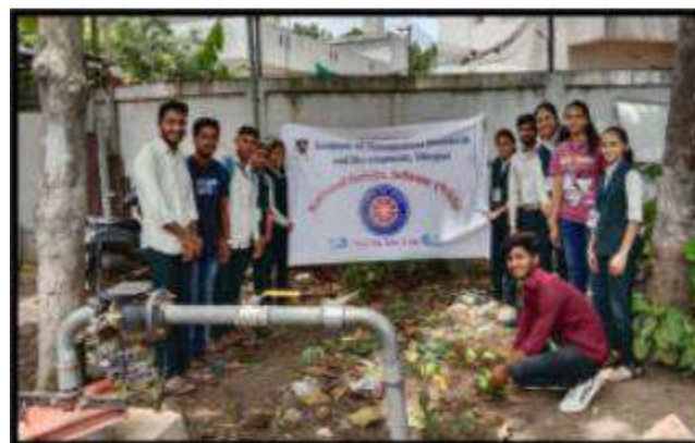
NSS Volunteers while planting plants