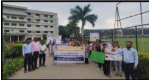
Public awareness rally on HIV-AIDS

The participants demonstrated unwavering commitment throughout the week, contributing to the collective efforts in raising awareness and fostering support for those affected by HIV/AIDS.