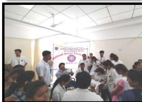
A glimpse into the impactful moments of the Sickle Cell Anemia Checking Camp