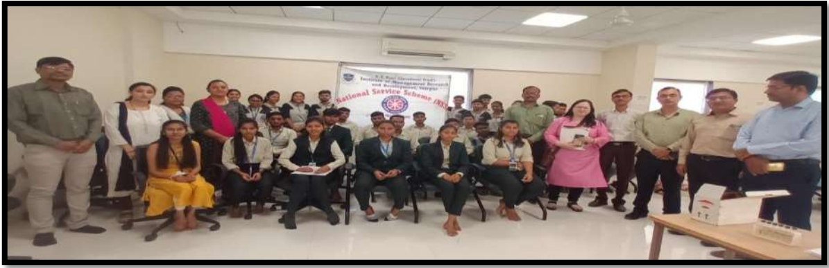
Volunteers and healthcare professionals join forces at the Sickie Cell Anemia Checking Camp for a healthier community.