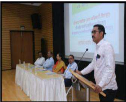
Dignitaries while guiding the students