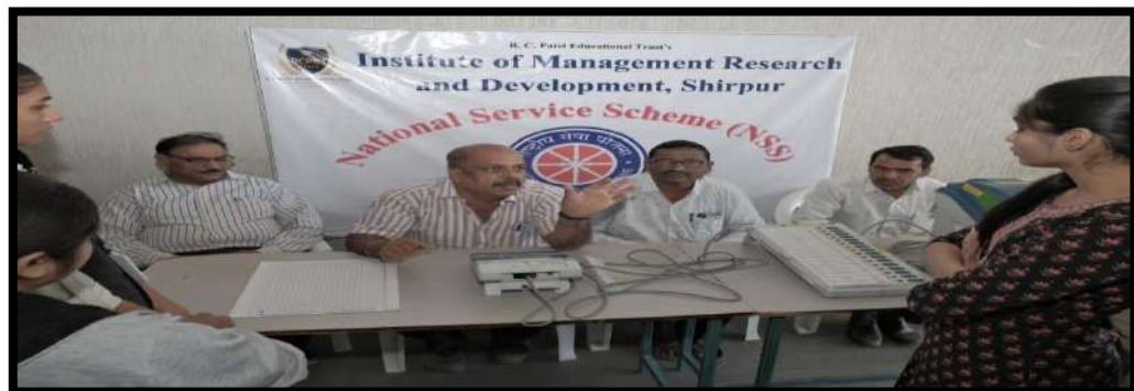
EVM Machine Demonstration