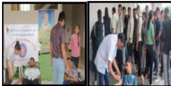
Student and volunteer donating blood