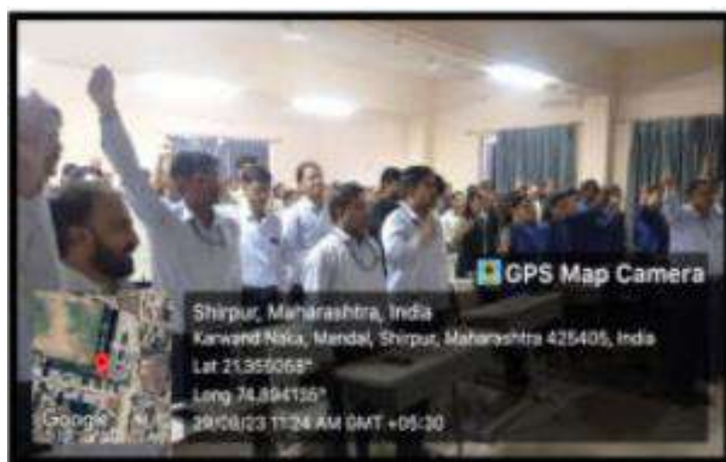
Grand salute to ISRO for successful mission of Chandrayaan-3