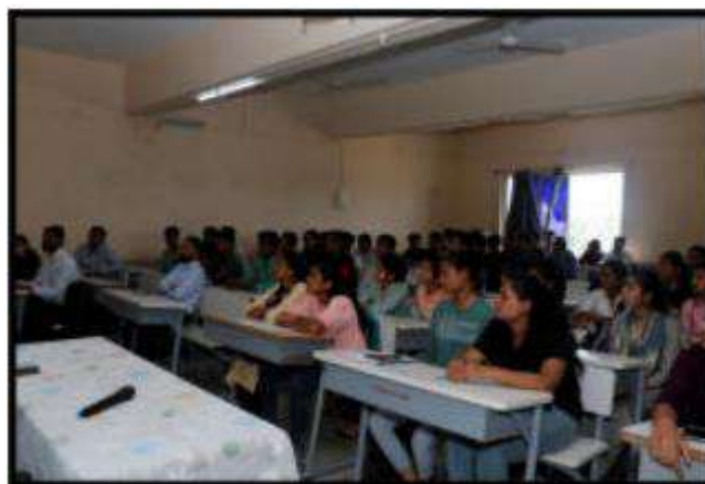
Expert Talk on occasion of International Day of Indigenous People