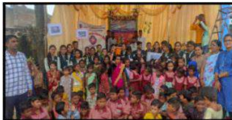
NSS volunteers celebrating Indigenous Day at Wanaval with Bhil Samaj Vikas Manch.