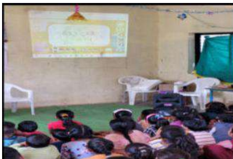
Digital Education for Primary School Students of Wanaval