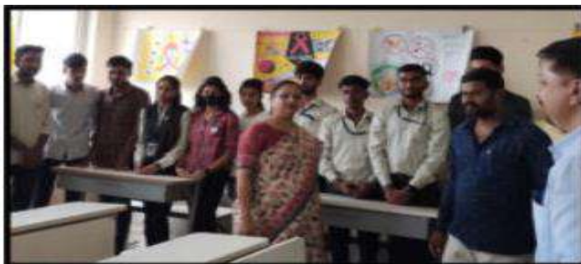
Students from various departments presented visually engaging posters that Conveyed vital information about HIV/AIDS