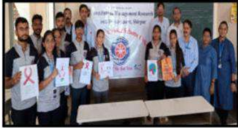
NSS volunteers and Students participating in the Poster Presentation competition