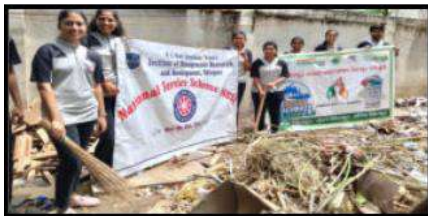
RCPET's IMRD and Shirpur Warwade Nagar Parishad leads the way in a massive clean up