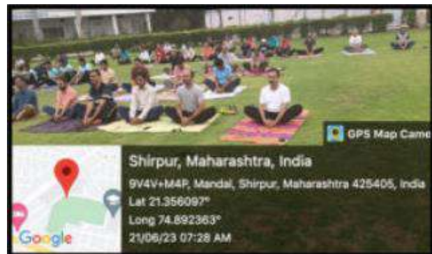
Trainer staff members doing Asanas during the session