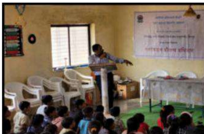
Seminar on E-Services for People