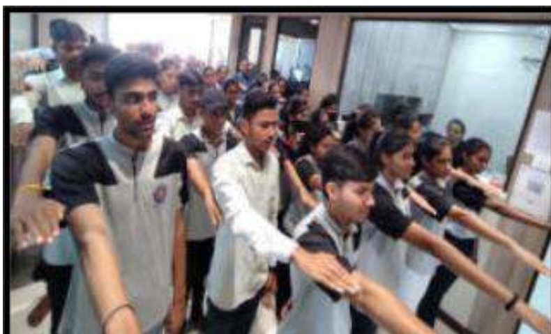
RCPET's IMRD: Promoting National Unity on a Special Day with oath of Unity by faculty members and volunteers