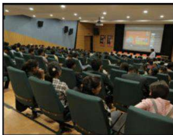
Live telecast of Namo Navmatdata Sammelan