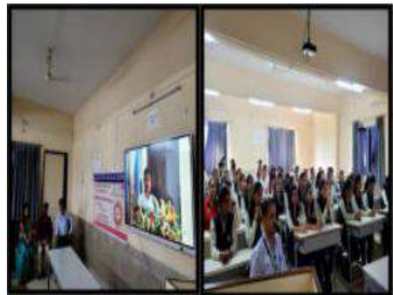
Students attending online live Facebook program