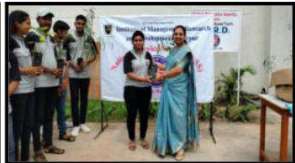
Fruit plant distribution to NSS volunteers and teaching staff for tree plantation