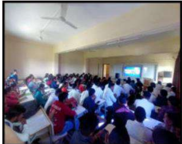
The Students Attending the Session