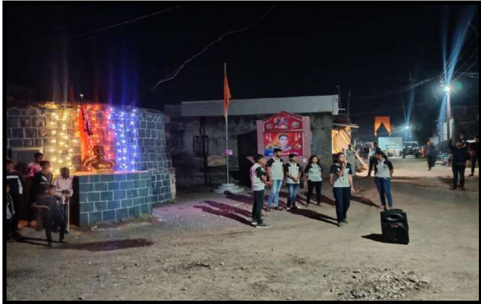
Volunteers performing in the street play on- “Beti Bachao Beti Padhao”