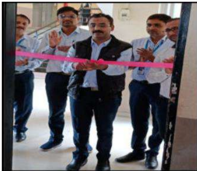
The ribbon-cutting ceremony marked the opening of the Poster Presentation competition