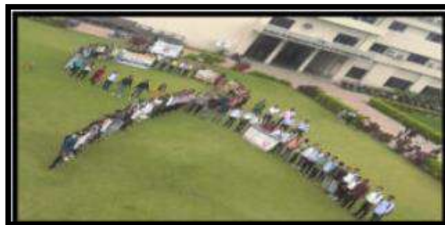
Students Creating a Powerful Human Chain