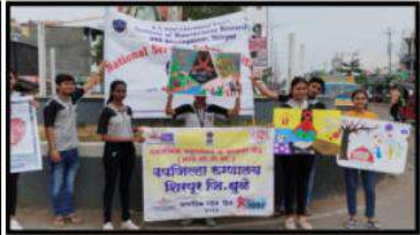
HIV-AIDS awareness Flash Mob event