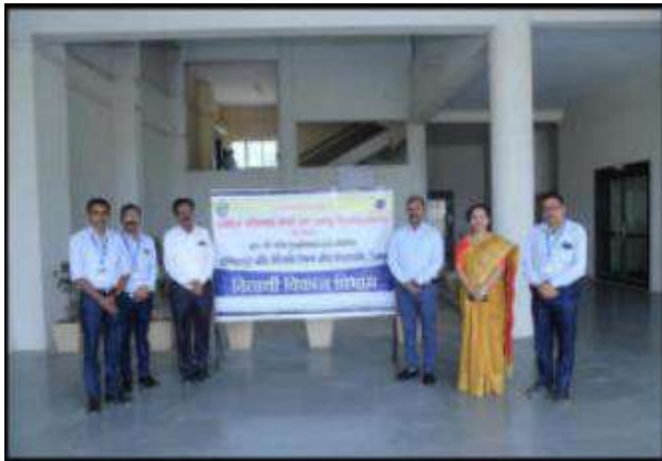
Inauguration of Voters Registration Camp