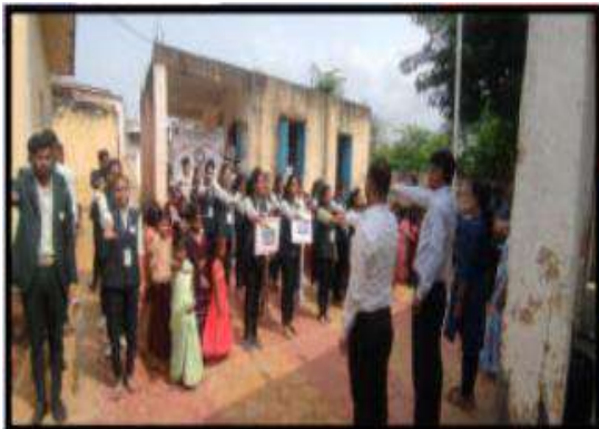
NSS volunteers taking an oath at Z. P. Primary School, Wanaval, Tal. Shirpur