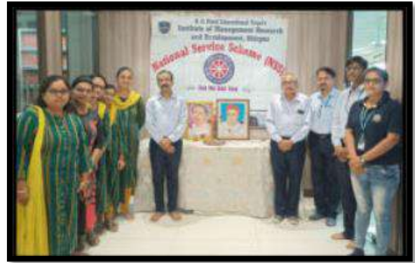
Faculty members paying a tribute to freedom fighters.