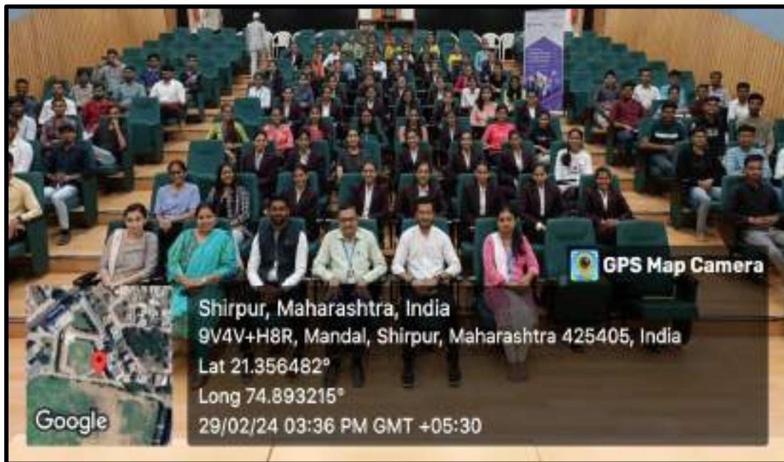
All participants in the AI with Python training