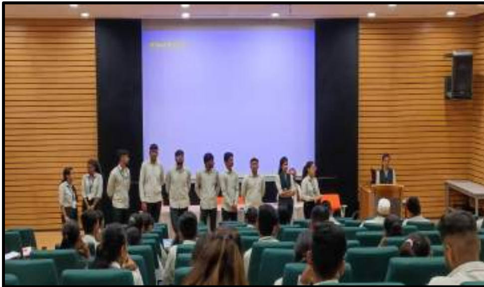
Rubicon Training session