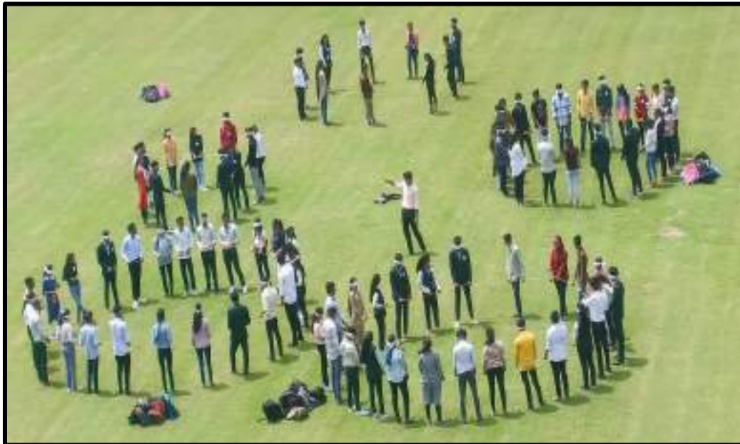
Activity in the ground