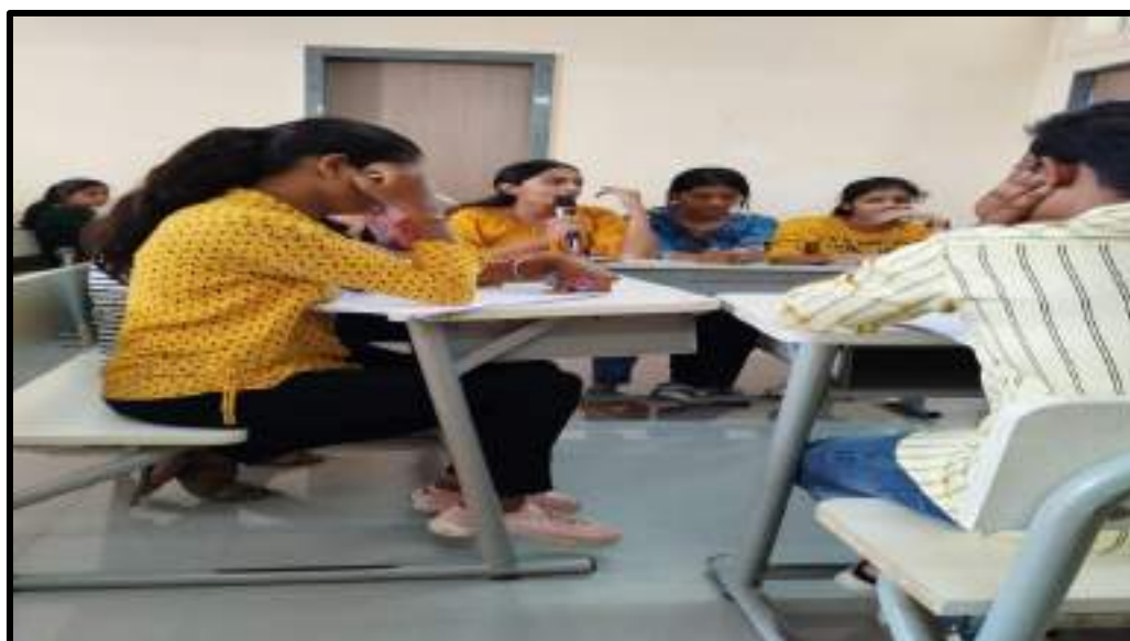
Group Discussion activity done by students.