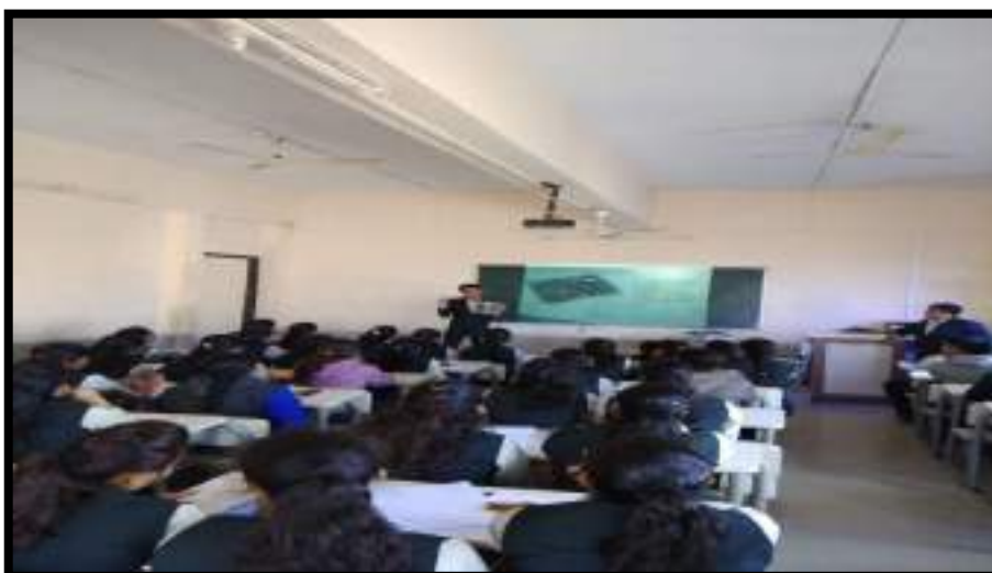
Students actively participated in class activies.