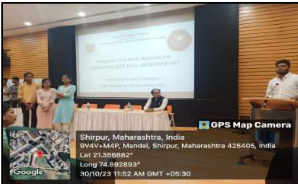
Student's interaction Activity