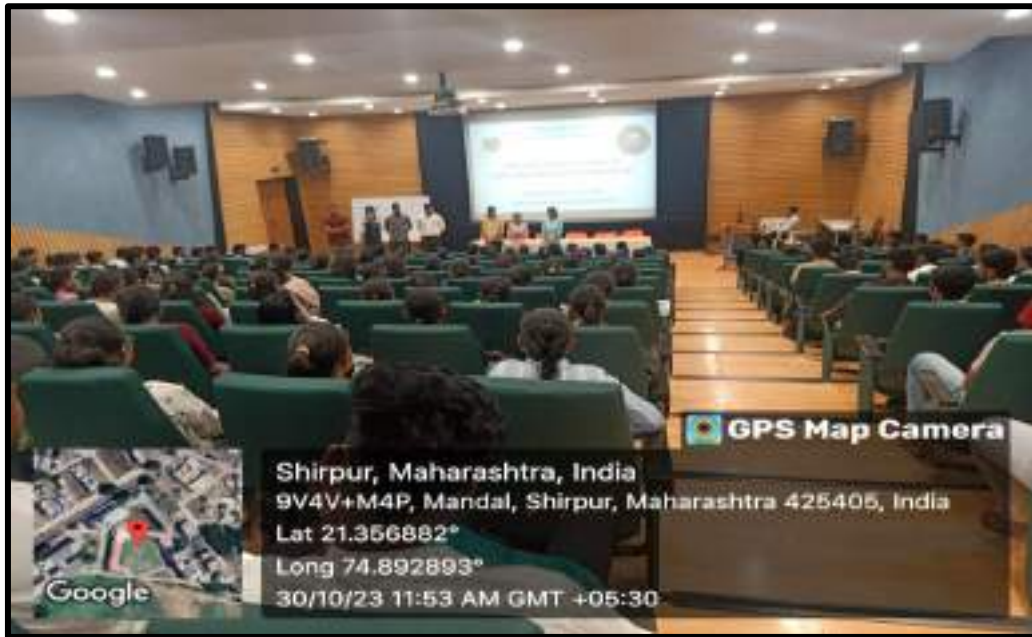
Students participated in event