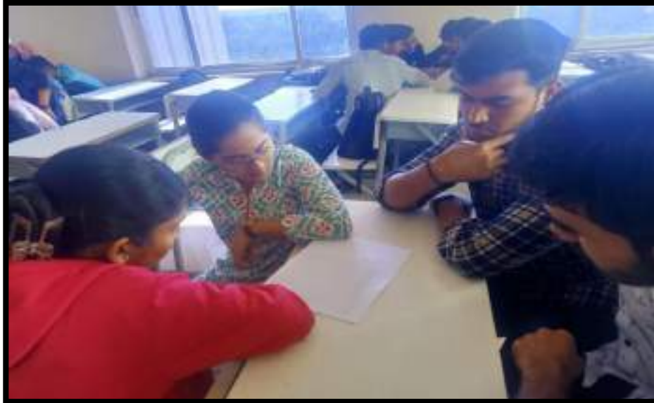
Students Participated in group discussion.