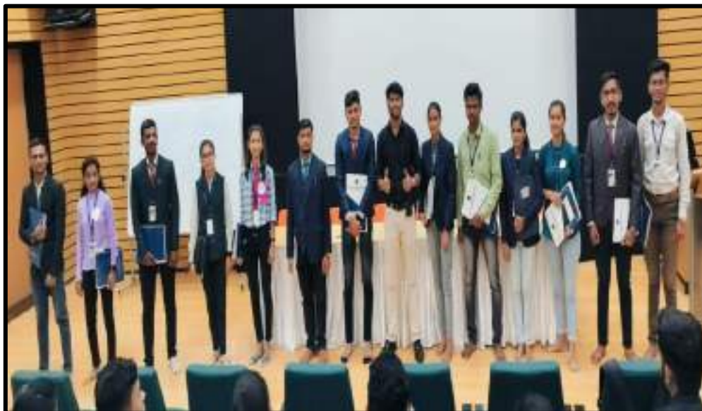
Session on Grooming