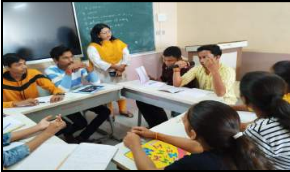
Group of Student Performing Group Discussion.