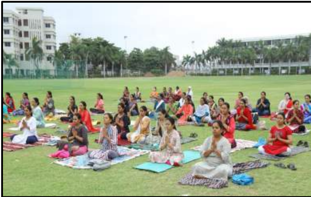
Staff members doing Asanas during the session