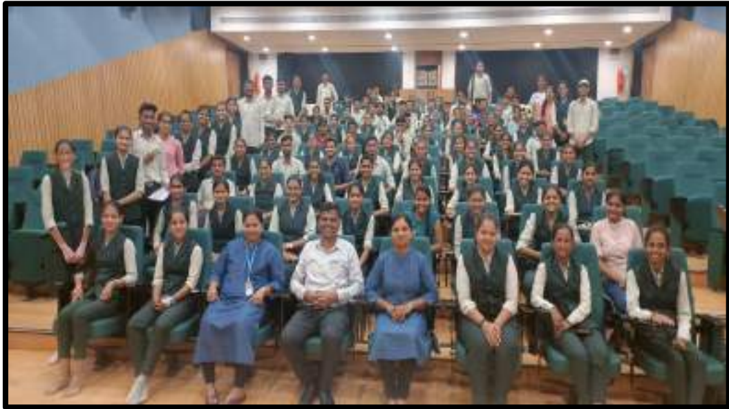
Students of TYBCA participated in Campus credential Training