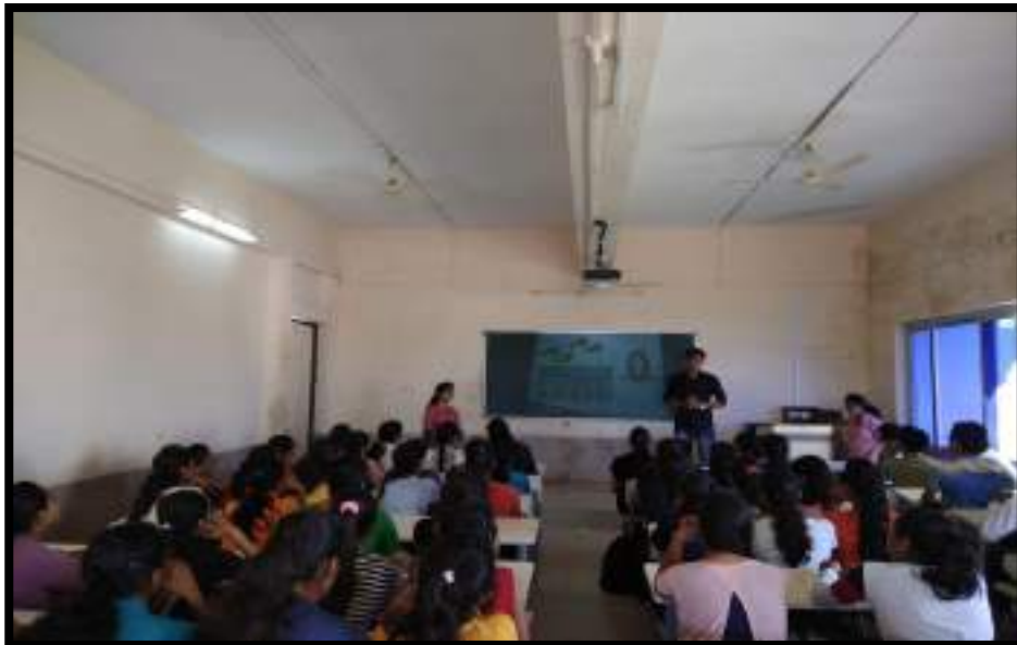
Students explain the presentations in class.