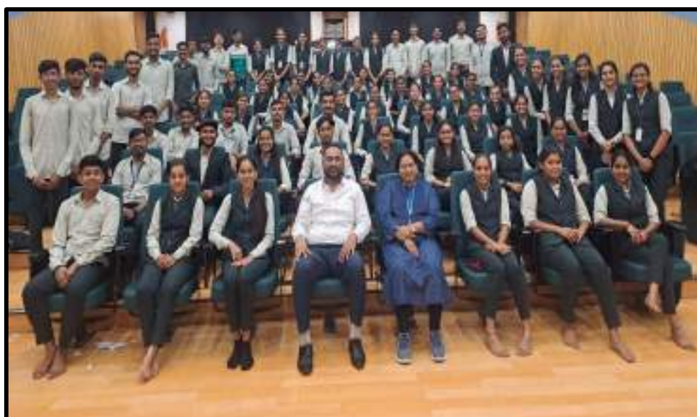
Final Year BCA Students participated in Training