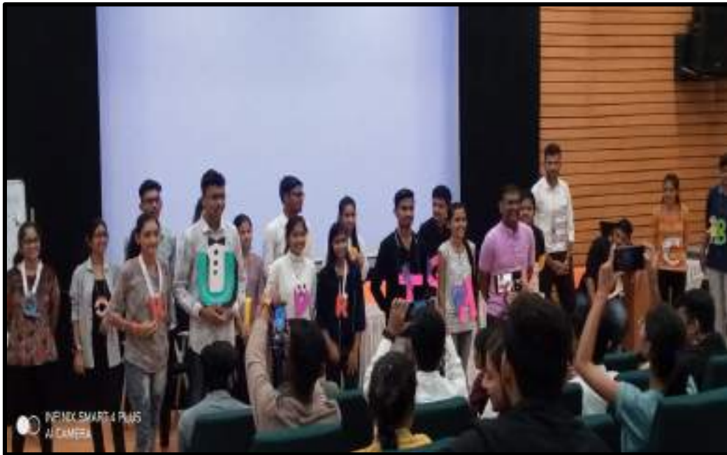
Students playing Vocabulary game