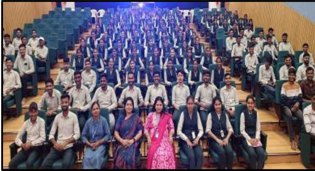
Students participated in the Workshop.