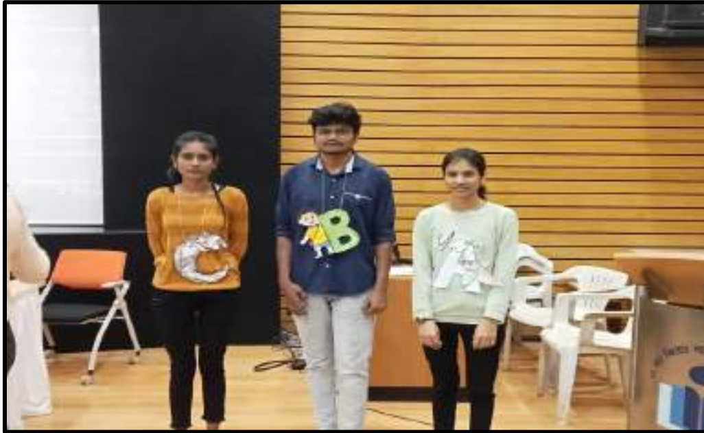
Active participant in event by students