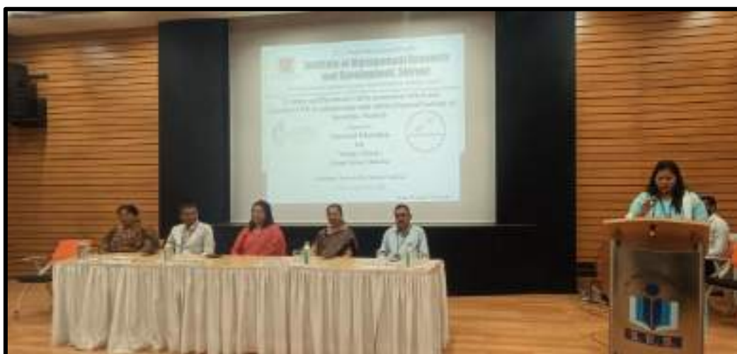
Inauguration of the Workshop on Financial Education for Young Citizens Kona Kona Shiksha