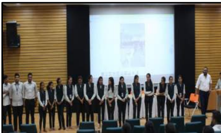
Students participation in Activity.