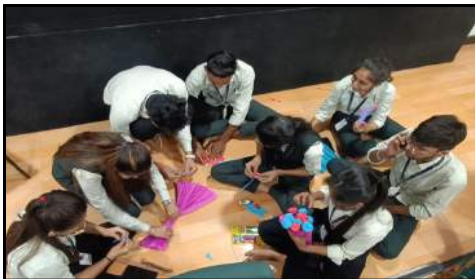
Students Activities in Training