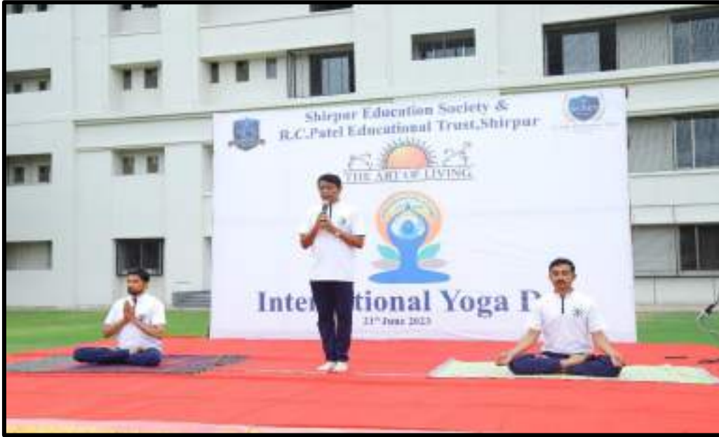
Demonstration of various Yoga postures by Yoga Trainer