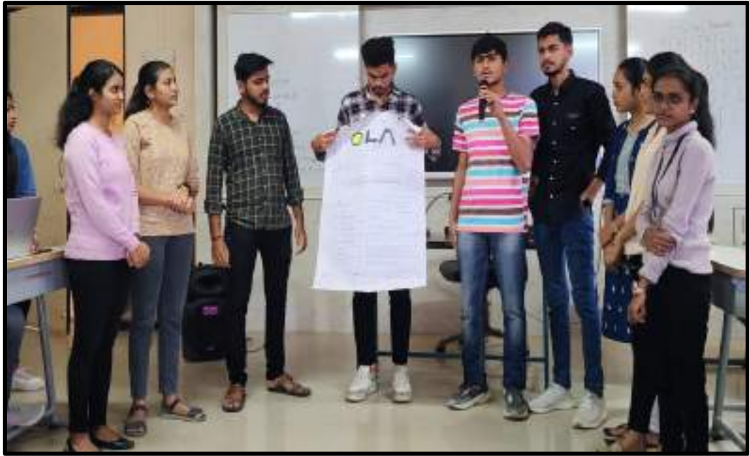
Students Participated in Activity during the Training