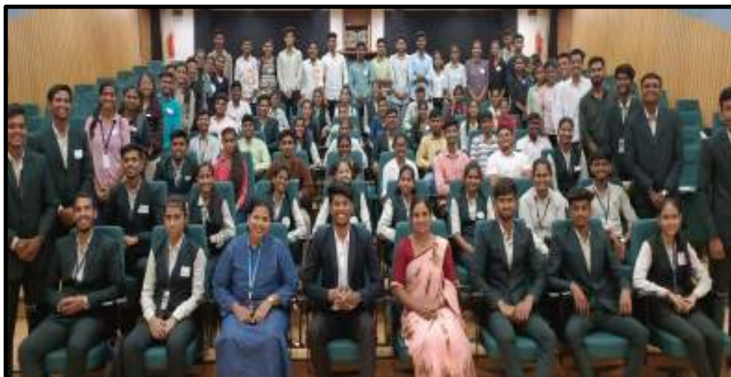
First and Second year BMS Students participated in Training