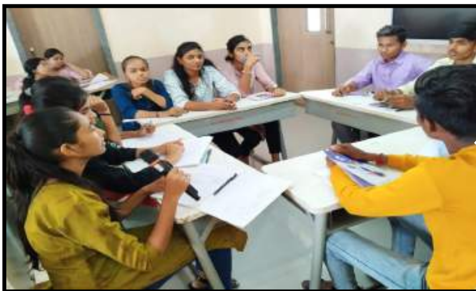
Students performed activity in class room