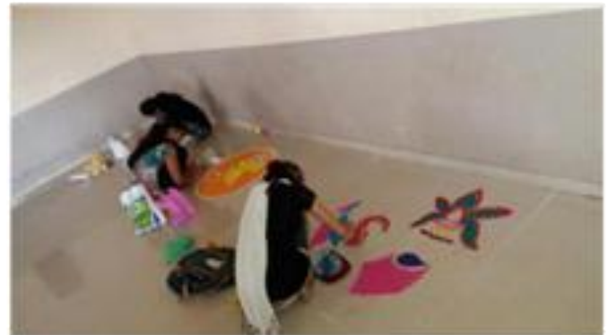
Girls While Making Rangoli.