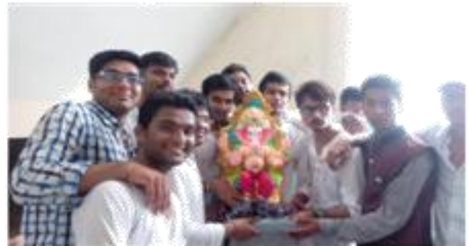
Ganesh Festival Celebrated in IMRD