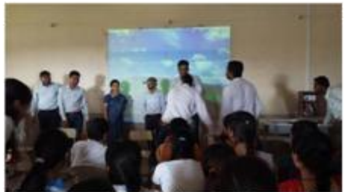
Teachers Participating In Interactive Games Arranged By Students.