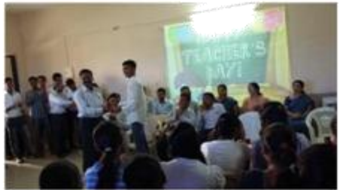
Students of MCA Felicitating Faculties