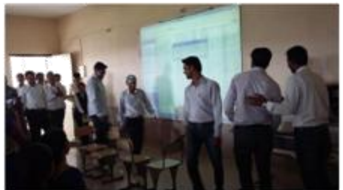
MCA Faculties Having Fun While Participating In Musical Chair.