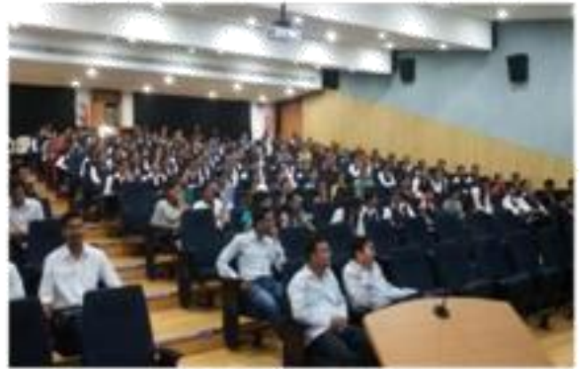
Faculties and Students Present in Workshop.