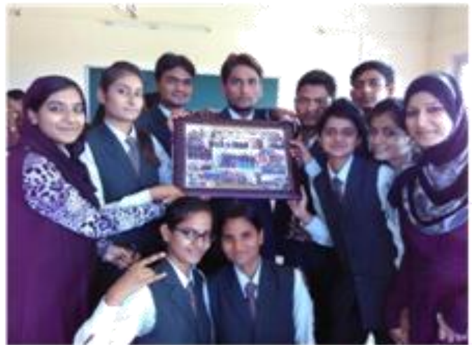
Students of Dual MCA Along With the Gift