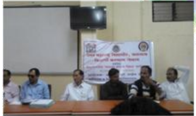
The Panel of Pathnatya Watching Performances by Students