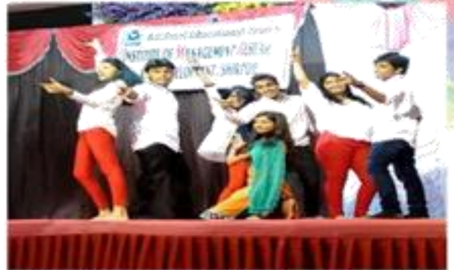
Students Performing Group Dance

All the teaching and non teaching staff gave their great support to make this event successful.