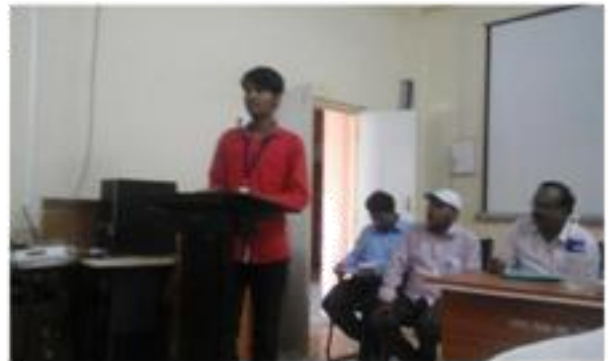
Student of IMRD Performing on Dias