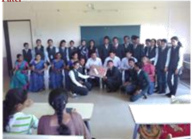
Dual MCA 2 nd Year Students Presenting Gift to Faculties.