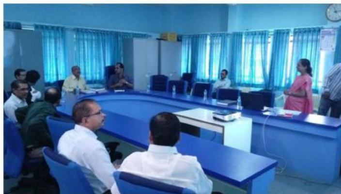
Dissertation is in process

Abstract - Parsed Corpus is essential for various Natural Language Processing (NLP) activities, but its availability cannot be guaranteed for most of the languages. Furthermore development of parsed corpus or parser is not easy task. This is because success of these approaches almost invariably demands a huge amount of computational resources that are not typically available for most of the natural languages. Aim of the present research is to develop parsing schemes for natural language sentences. Parsing approaches viz. rule based or statistical, suffer from an inherent drawback that they typically lack a significant volume of computational resources. Languages lacking such computational resources are called “resource deficient” languages. Marathi language is one of the official languages in India, morphologically rich and free word order in nature. In this thesis, we propose a way of formulation of Marathi language grammar in Link Grammar formulation and parsing of such formulated grammar by using proposed Link Grammar Parsing Algorithm for Marathi.