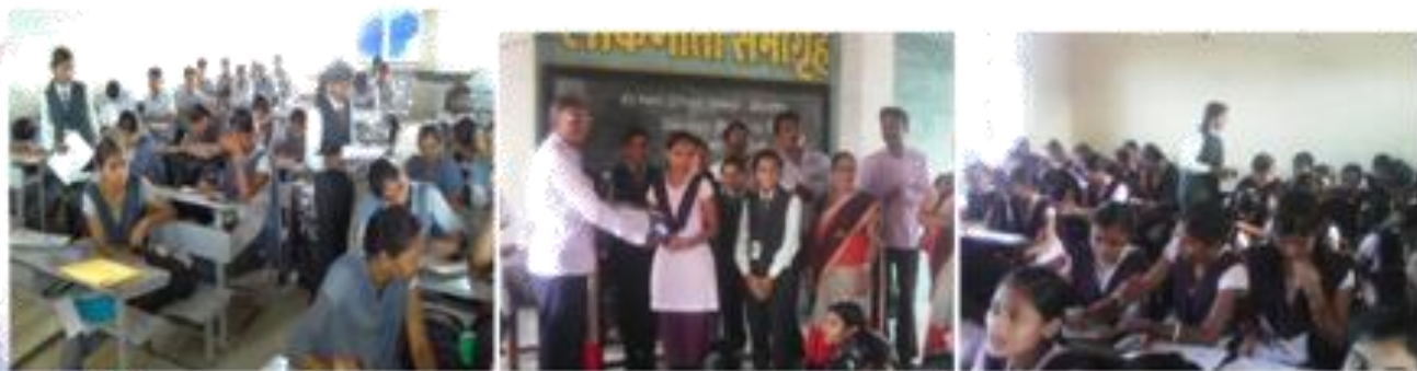
IMRD Students Conducting Teacher's Day Best Message Contest 2015 At Various Colleges.