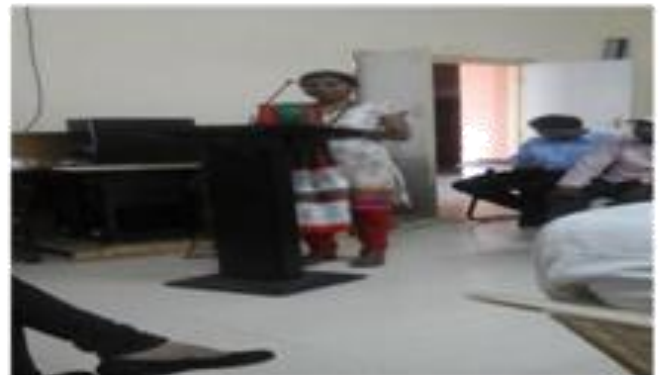
Student of IMRD Performing on Dias