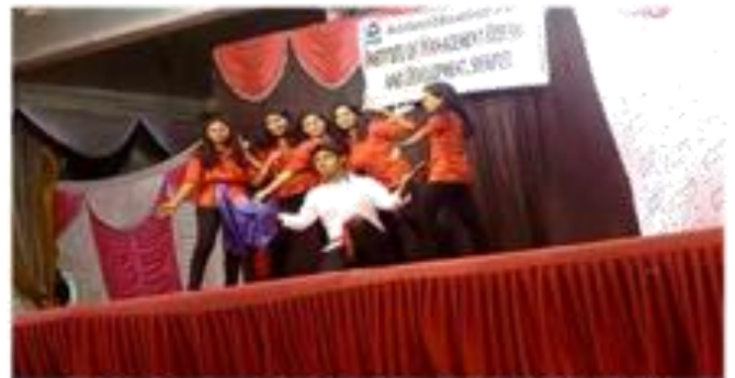
Students Performing Group Dance