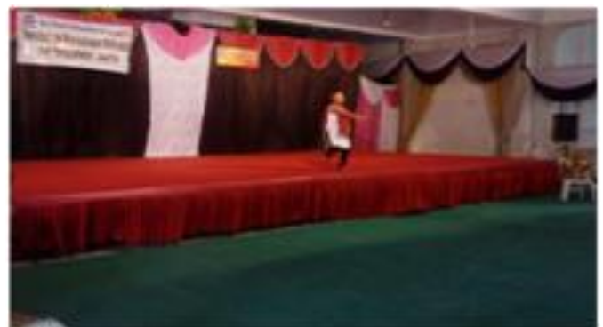
Girl Student Performing Solo Dance