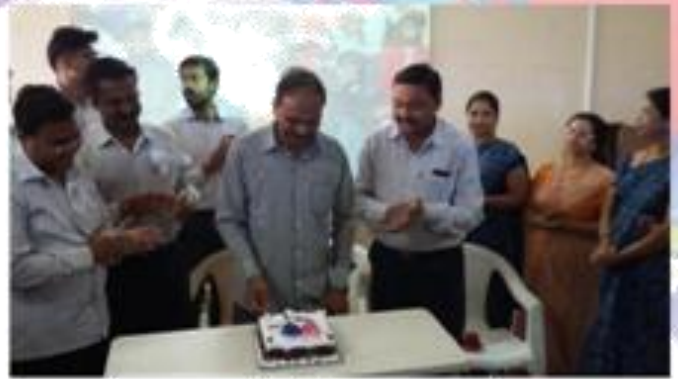
Cake Cutting By Teaching and Non-Teaching Staff