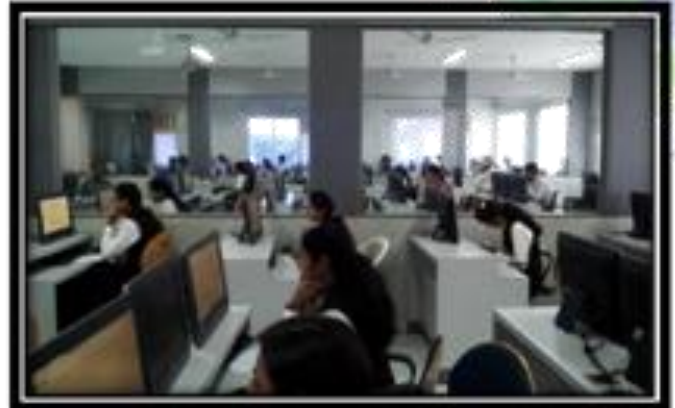
MCA students while giving Online Technical Test