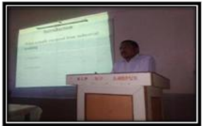
HOD of MCA while conducting session on IT Awareness