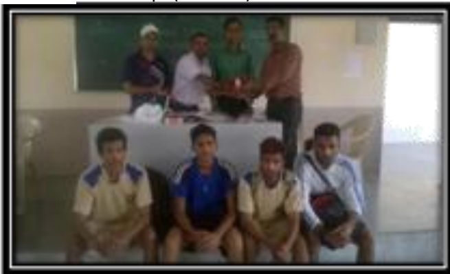
IMRD Students while receiving prize