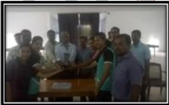
All the winners with winning Trophy.

12th Senior National Jump Rope Championship 2015-16 was organized by Jump Rope Federation of India in association with the South Asian Jump Rope Federation and Asian Rope Federation at Puducherry.