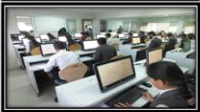
Students while giving Online Aptitude test