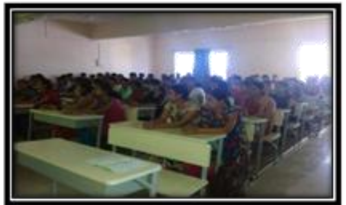
MCA 3 rd year students present for workshop