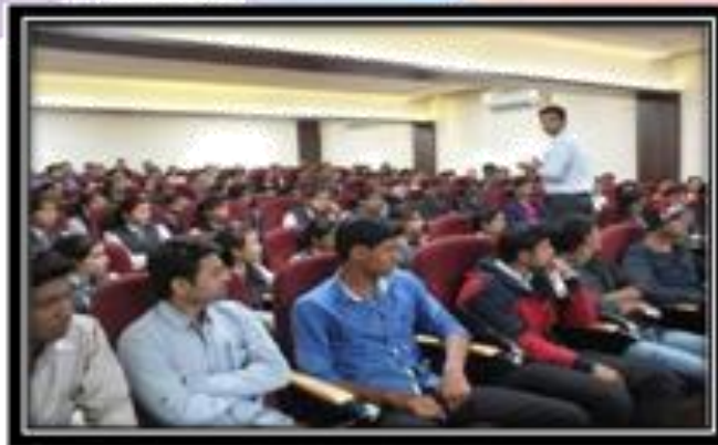
Total 400 students presented for Pre-placement talk.