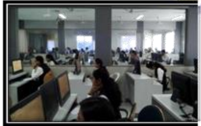
MCA students while giving Online Technical Test