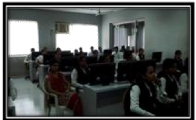
MCA students present for Campus Drive