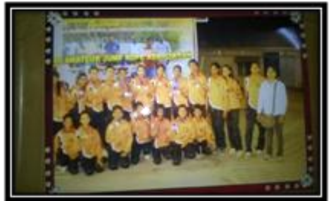
All the winners of 12th Senior National Jump Rope Championship 2015-16