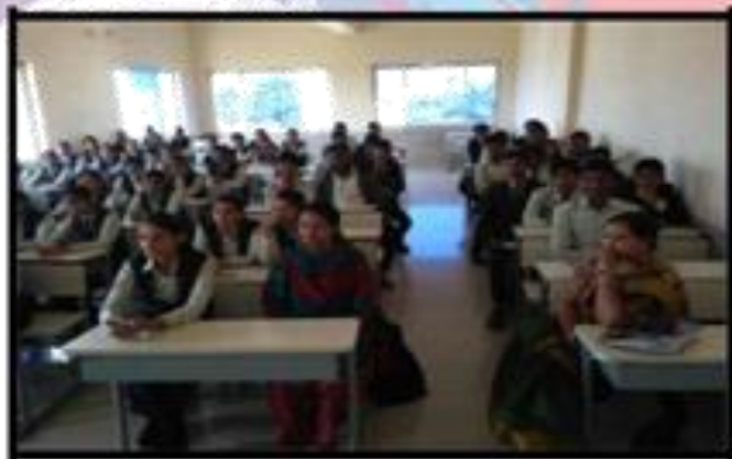
Students of BCA first year participated in event.

All the students from BCA first year gave their best support to make this event successful.