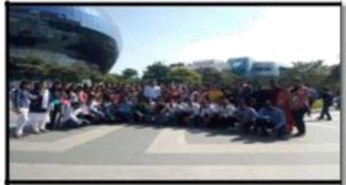
IMRD Students and faculties at Infosys, Pune.