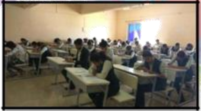
Students while giving aptitude test

All the students got inspiration by this activity and started improving their skills. All the UG and PG faculties gave their best support to make this event successful.