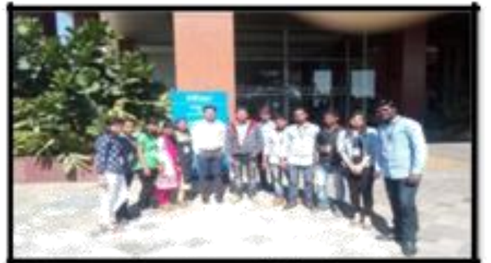
BBM students with faculties at Infosys campus.