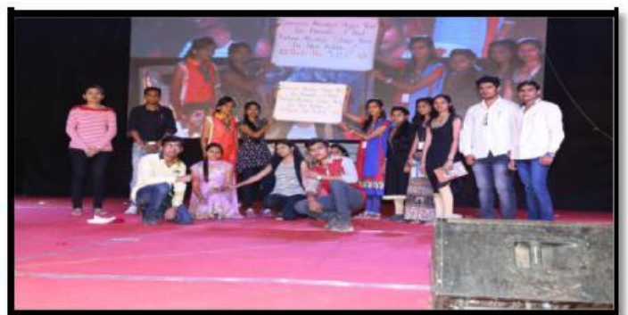
Student's performing various activities during the event.