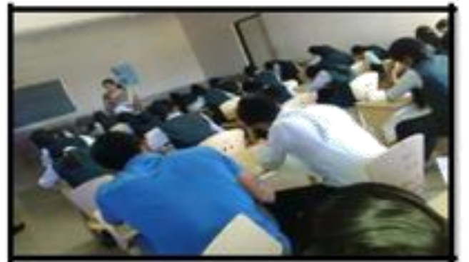
Students engaged in writing essays.