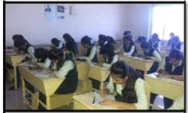
Students while participating in the essay Competition

This completion prove be a strong motivator to write well and inspiration for others too. This will be of considerable benefit to the student. It also helped the students to build the writing skills necessary for academic achievement. It was very nice initiative by library department to motivate and inspire all the students of IMRD.