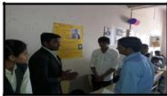
Dual MCA 1 st year students while presenting their posters.