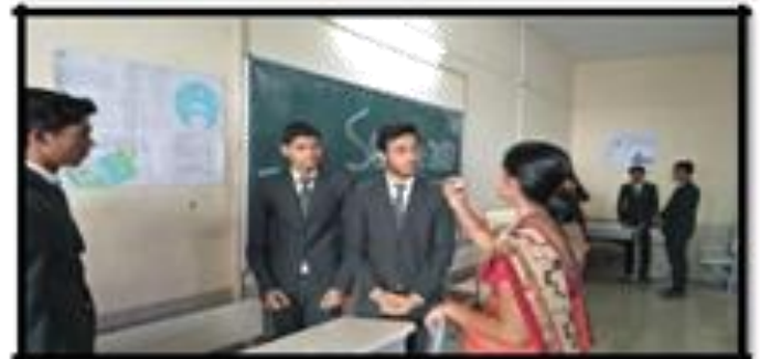
Judges while visiting posters