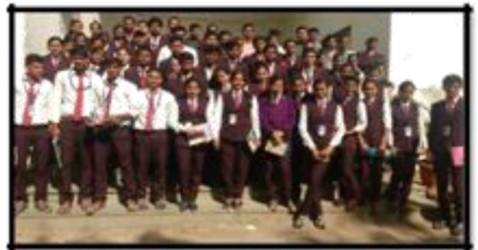
MBM students while visiting to Dessan Textile