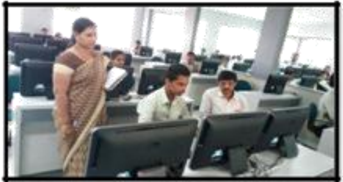
Judges while evaluating participants