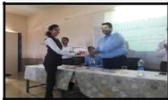
Winners of the event rewarded with certificates and pen drive.