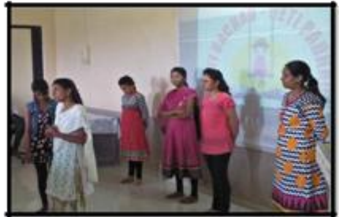
Girls Students performing Pathnatya on "Beti Bachav Beto Padhao"