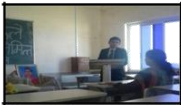
UG students sharing their views.