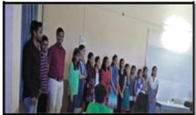
Students while participating in different activities.