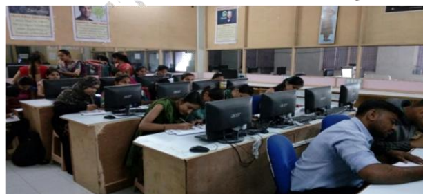
Students participating in Youth day best message contest.

National Youth Day was celebrated with the great joy and enthusiasm in institute by UG and PG department on 12th Jan 2017. Institute students conducted best message contest in 22 different colleges in NMU region. Total 30 students of institute conducted this contest along with 12 faculties.