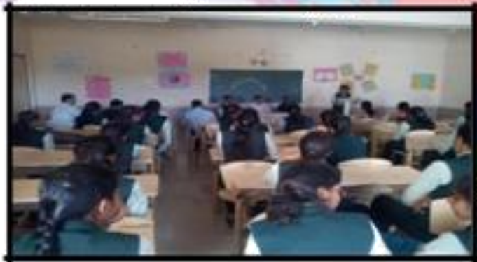
Faculties and students at inaugural function of Self defense.

All the UG faculties gave their great support to make this event successful.