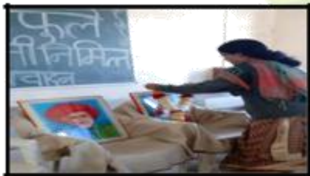
Faculty members paying homage to Jyotirao Phule and Savitri bai Phule

No words are enough in the praise of Savitribai Phule, for she was an icon who dared to go against the tide and would remain an inspiration not only to the women in 21st century, but also for the generations to come