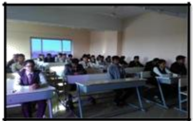
Meditation practice by UG students before credit test exam.