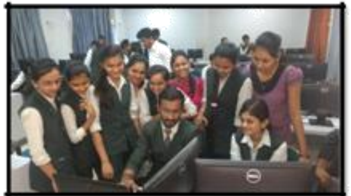
Second year BCA students while visiting to Software Exhibition