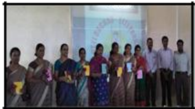
Ladies faculties honored by BBA first year students