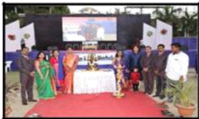
The Director of IMRD with Chief Guests while inaugurating the event.