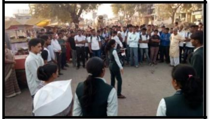
Students performing street play at Karwand Naka, Shirpur.