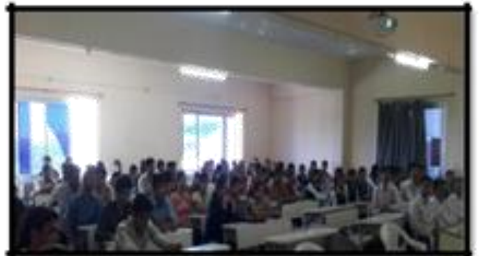
Student presented for the event.