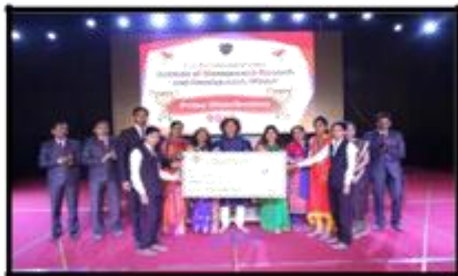
MCA students while receiving R.C. Patel Memorial Scholarship award