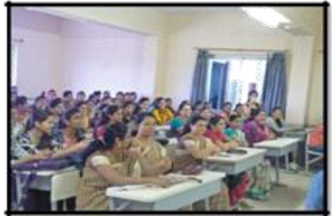
Faculties and students present for the event.

This event was very innovatively organized by the BBA first year class hence all the faculties appreciated the efforts taken by students.