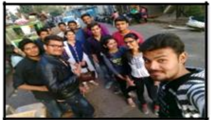
Alumni meet during industrial visit at Pune