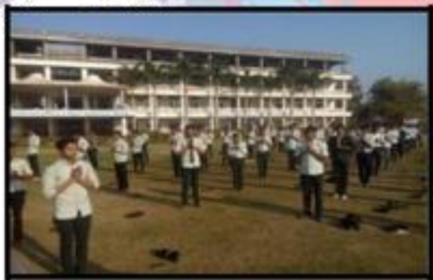
UG students while performing Surya Namaskar