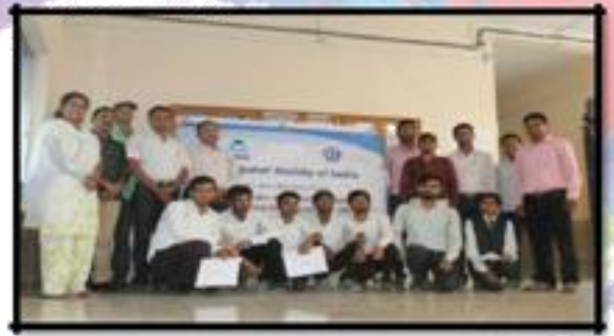
All the Winner participants with HOD's and faculty members.