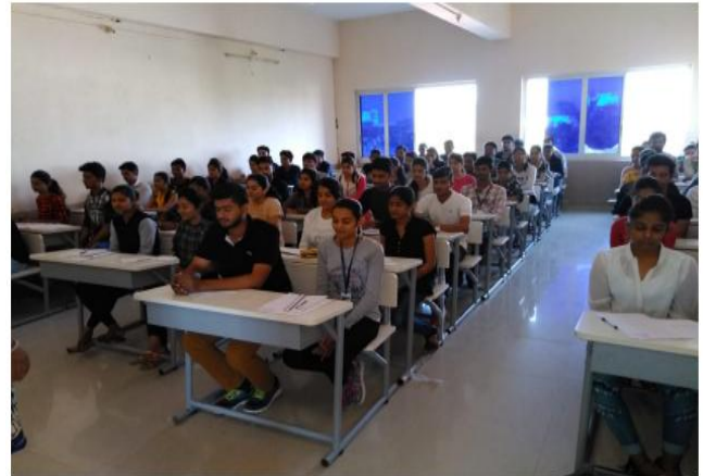
Meditation session for UG students before exam.

Institute conducts two minutes meditation session for students to refresh their mind and increase concentration power before internal examination in exam hall.