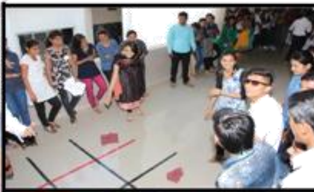
Tic Tac Toe