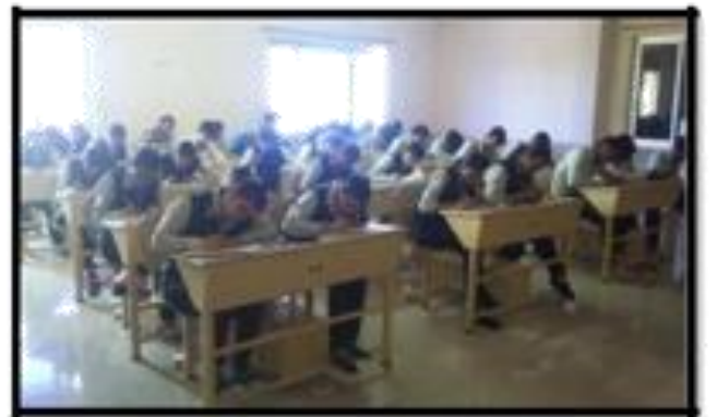
UG and PG students while participating in the essay competition.