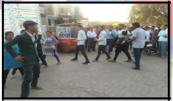
Students giving message to society through street play.