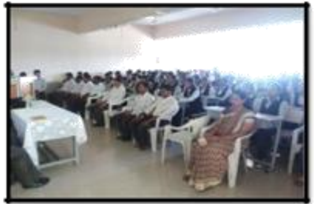
Faculties and Students of IMRD participated in workshop.