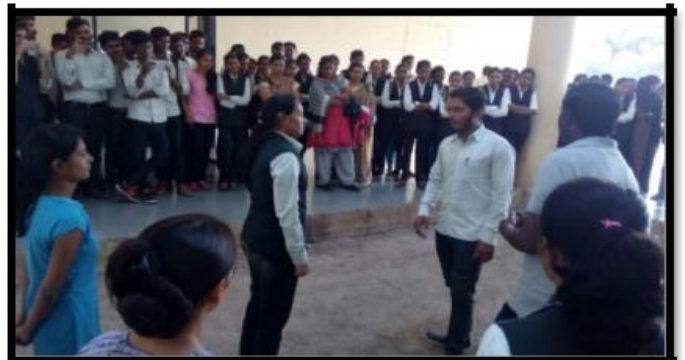
Outstanding performance by Students