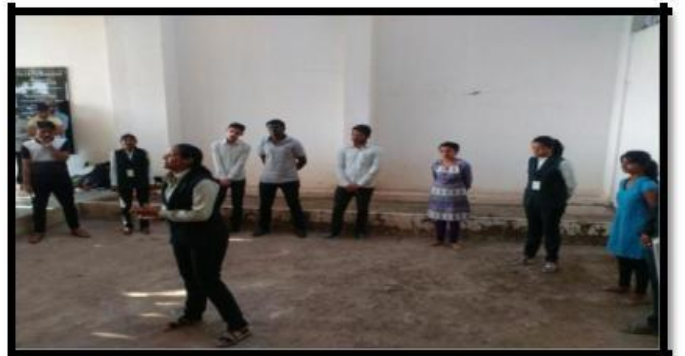
Street Play performed by students at IMRD