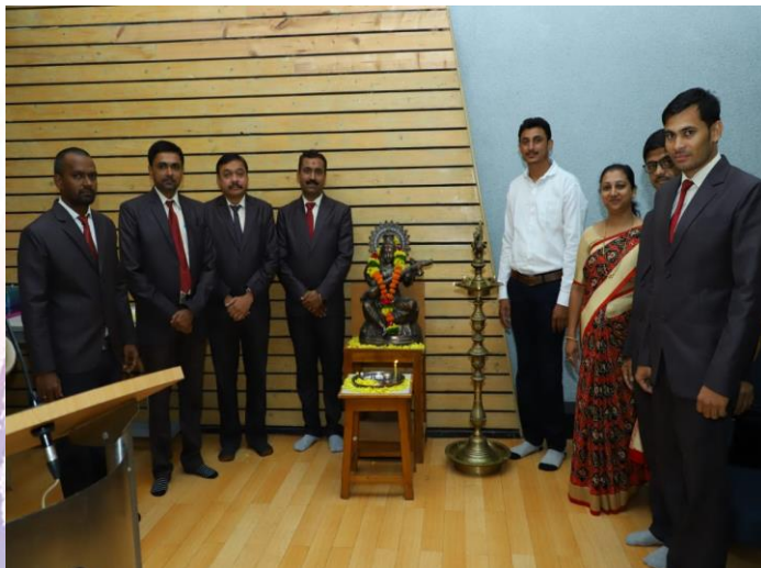
Inauguration of induction program