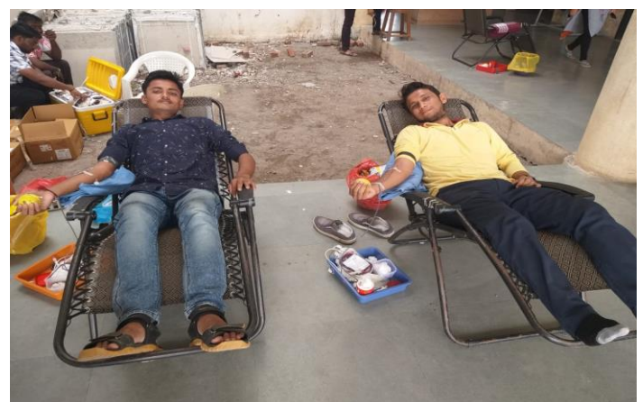
RCPIMRD Students donating blood