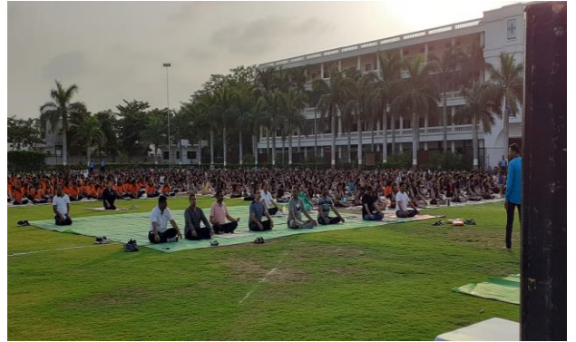
Principals, faculties and students participated in international yoga day