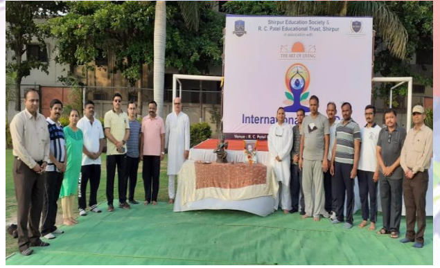
International yoga day inauguration by dignitaries

With the same enthusiasm Institute of Management Research and Development celebrated the “International Yoga Day” on 21 st June, 2019. Student's Welfare Department of RCPIMRD, all the faculties and staff members were invited to celebrate “International Yoga Day” at Institute ground at 06:30 am. On this occasion the team of art of living was invited for yoga demonstrations. Different types of asana like Virasana, Vajrasana, Utkatasana, Tadasana, Urdhvamukhasana, Trikonasana, Sukhasana, Shashankasana, Makarasana, ArdhaMatsyendrasana etc. were practiced enthusiastically by participants. RCPIMRD always conduct such kind of workshops, seminar on yoga, diet etc. The Student’s Welfare Department team and all staff members gave their great support to make this event successful.