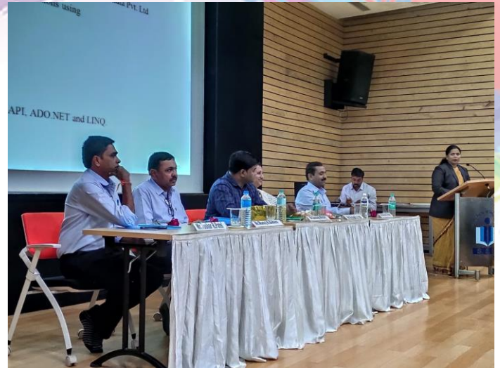
The Dignitaries at induction program