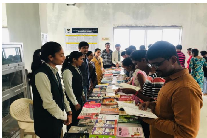
First year students visiting books exhibition