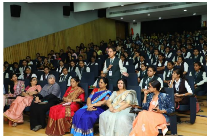
A student interacting with dignitaries