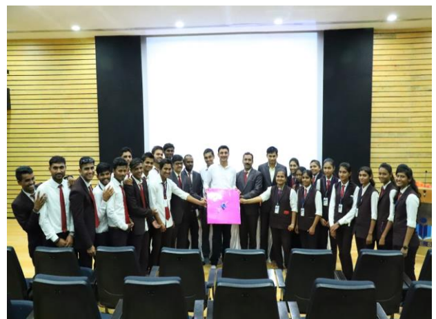
MMS second year students giving token of love to MMS department