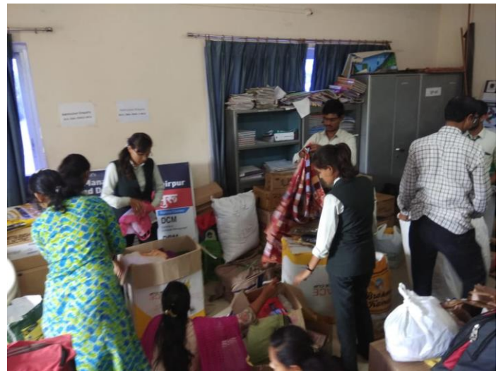
RCPIMRD staff while doing material packing