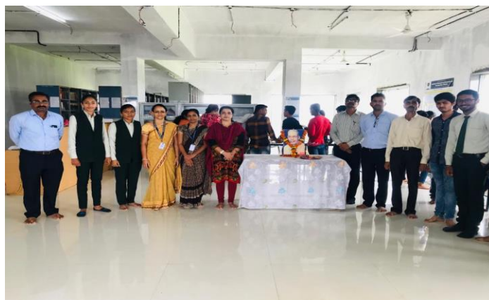
Library committee members and student volunteers at event