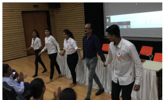
Confidence building and stage daring activity conducted by students in "Summary Showcase"