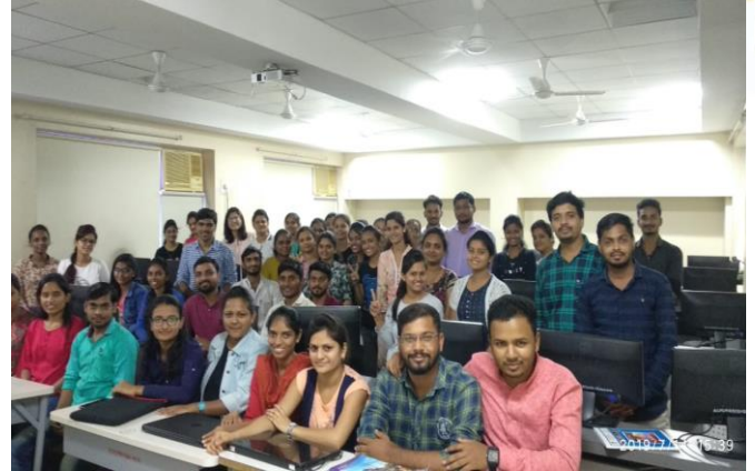
Students participated in AngularJS and Nodejs training program

Students were trained in all technical aspects by Mr. Suraj. After the training program students were distributed in groups and few projects were assigned to them like job portal, Hotel booking system, medical chat board, online movie management system etc. Students enjoyed this training program and learned various new concept of web development. Students thanked to institute and T&P cell for organizing such an amazing training program for them.