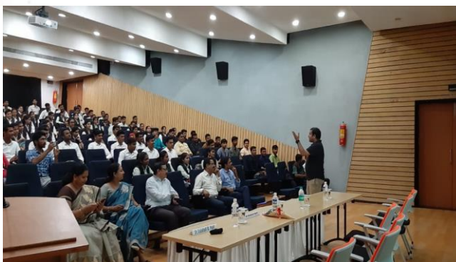
Students participated in career guidance seminar