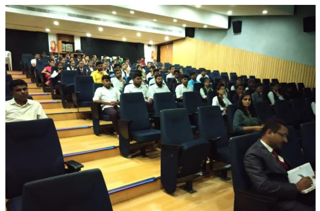
Final year students listening to resource person