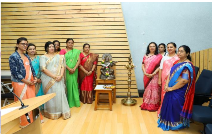
Garland of Maa Saraswati and lightening a lamp