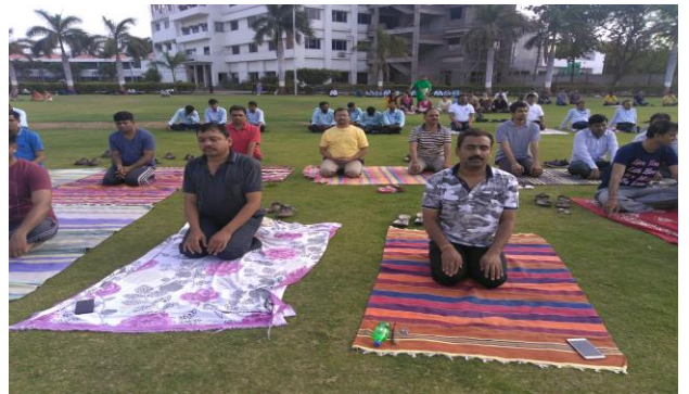
Faculties performing vajrasana at international yoga day