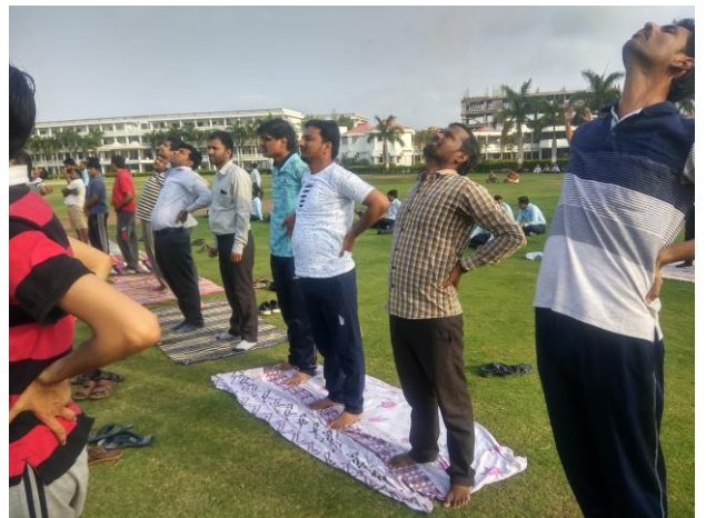
Faculties participated in international yoga day