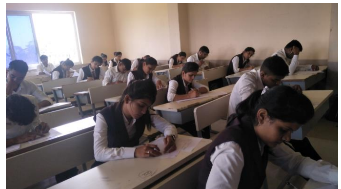
Students participated in aptitude test

Various topics were covered in this series like problem on train, time and work, problem on ages, ratio proportion, height and distance, HCF and LCM etc. Many test on technical skills were conducted like, C++, java, .Net, DBMS etc. Even students conducted few seminars on the topic and shared their knowledge with others. This was great activity by training and placement department through which students were able to enhance their problem solving abilities and improve their technical skills.