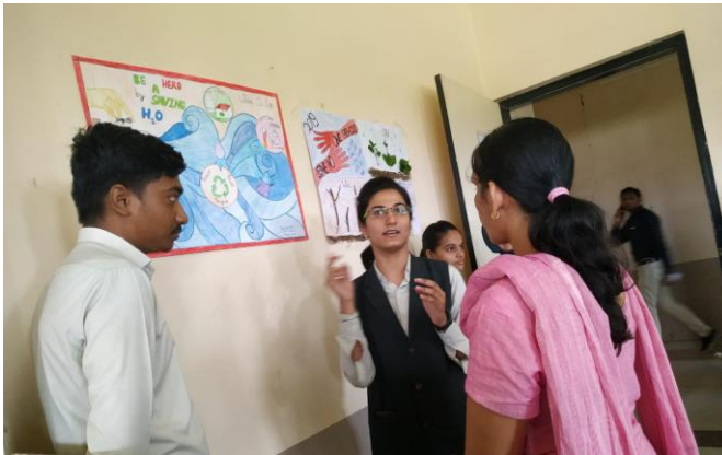
Students participated in poster presentation on the occasion of Jal Diwas