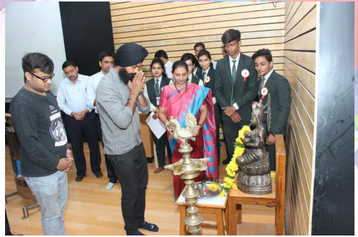
Garland of Maa Saraswati and lightening a lamp