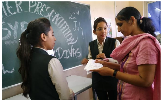
Judges while evaluating posters