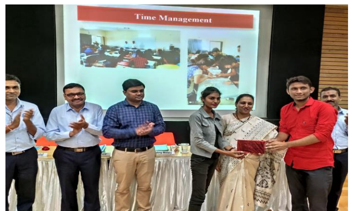
Prize distribution to winners of activities