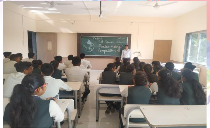
Jal Diwas celebrated by faculties and students

The students from all 2 nd year and 3 rd year participated in this event and created innovative posters, drawings and all the students participated in this activities enthusiastically and gave a message of "Save Water Save Life"