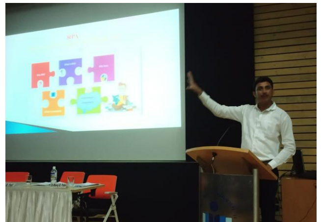
A detailed explanation of RPA by resource person