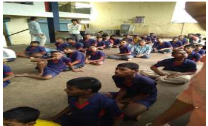
Students of Sumangalam Anathashram feeling happy after meeting to their new friends.