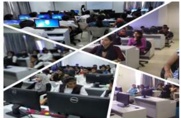
Students participated in aptitude seminar.