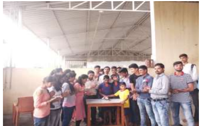
Birthday celebration of orphanages at Sumangalam Anathashram.