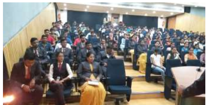
Students present for the event.