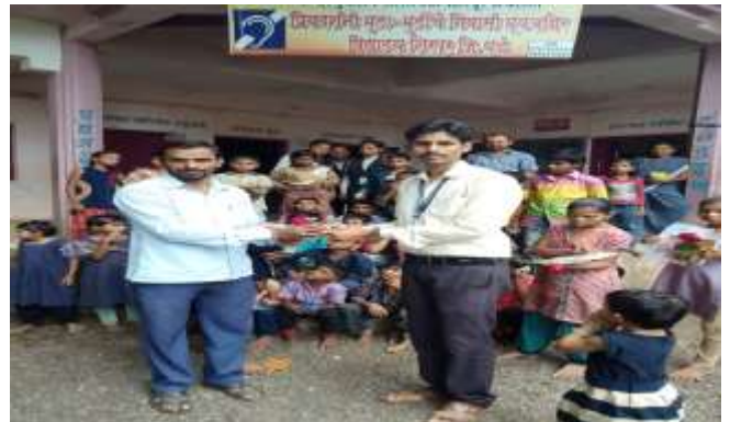
Teachers of dump and deaf school felicitated by UG faculties.