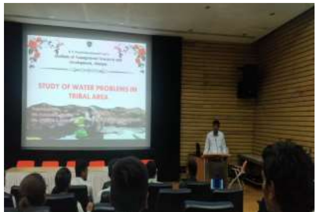
Students were made aware of different issues in society.