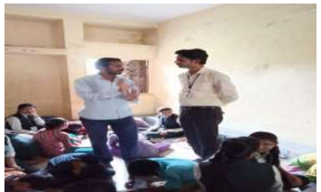
Faculty visited during the competition.