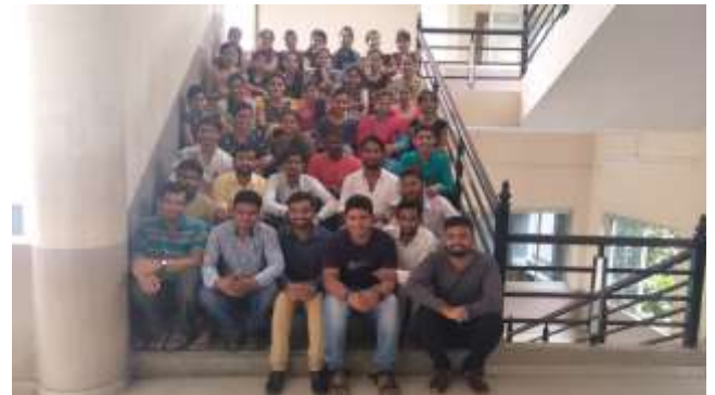
Students participated in Android training program.