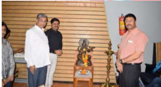
Lamp lighting ceremony by chief guest and dignitaries.

All the students of IMRD thanked to IMRD faculties for giving an opportunity to attend such a wonderful event.