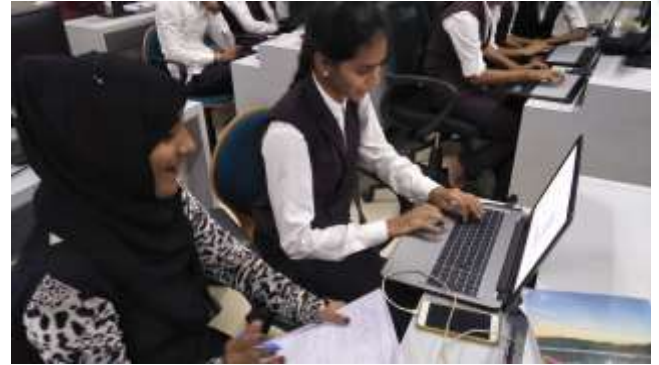
Students practising mobile application development.

All the students learned all this techniques and were able to develop different applications due to this technical training. Apart from this Mr. Suraj also shared carrier guidance to all students through which they were aware with different IT scenario. All the students thanked the institute and training and placement cell for organizing such a great technical training for them.