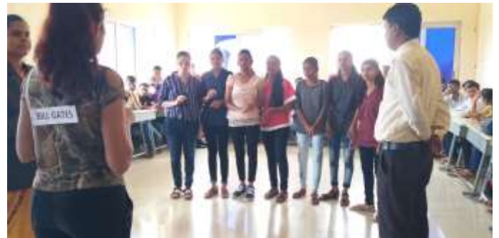
Events organized for all first year students present for the event.