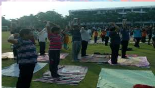
IMRD Faculties and students participated in yoga day