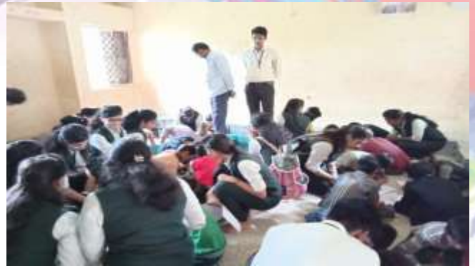
UG students were engaged in drawing and craft competition with special kids.