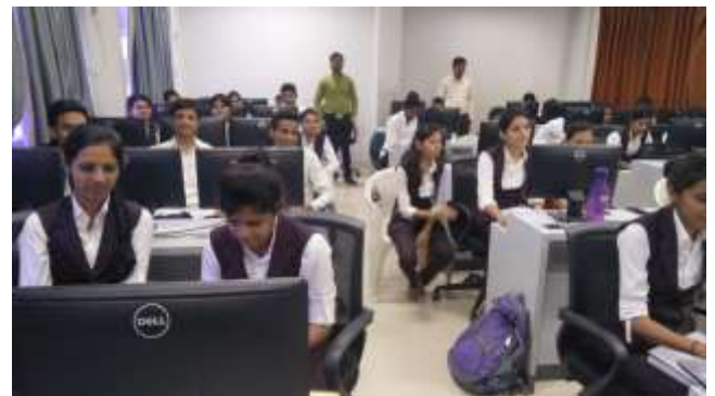
Students doing their practises in labs.