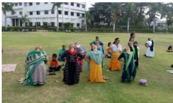
IMRD faculties following the steps of yoga.