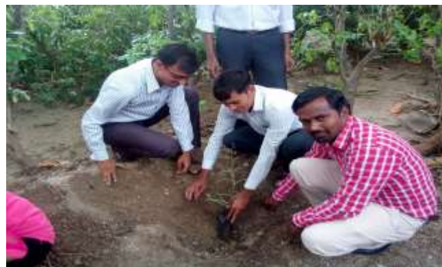
Faculties while planting trees.