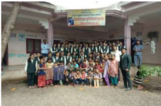
Faculties and students of IMRD visited to dump and deaf school.

The event of Guru Purnima was celebrated in IMRD enthusiastically by UG student's on 28 th July 2018. This year students of IMRD celebrated Guru Purnima event in different manner. On the occasion of Guru Purnima Students from SYBCA organized drawing competition and paper crafting competition for special kids of Priya darshini dump and deaf girls and boys school, Shirpur. The main aim of this drawing and craft competition was to engage children in a creative exercise to identify their hopes and dreams of the future. It allowed complete self-expression and supported their creativity and innovative ideas expressed through art. Among all this students best three drawings and crafts were awarded by the faculties and students of IMRD. IMRD students also distributed some snacks like Biscuits, chocolates to all these students and enjoyed this day with these special kids. Below are few glimpses of this event.