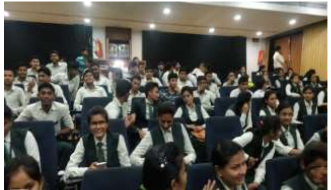
Final year students participated in event