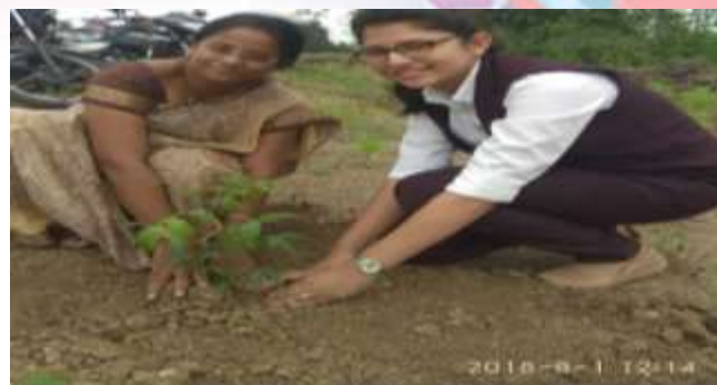
MCA faculties and student while planting trees

All the UG and PG faculties, students from all departments participated in this activity and planted multiple trees. All the teaching and non-teaching faculties gave their great support to make this event successful.