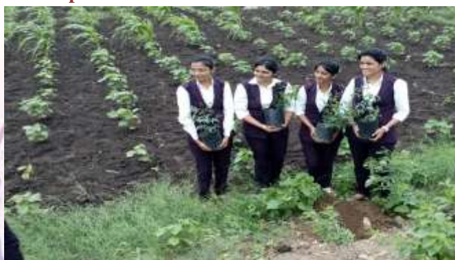
MCA girl students planting trees