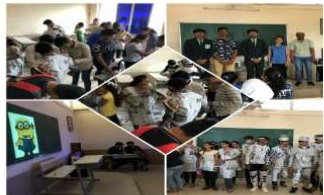
Students participated in various activities.