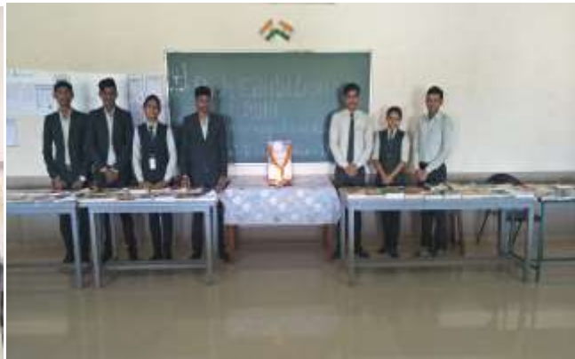
Birth anniversary of Dr. Sarvepalli Radhakrishnan celebrated by Library Department.