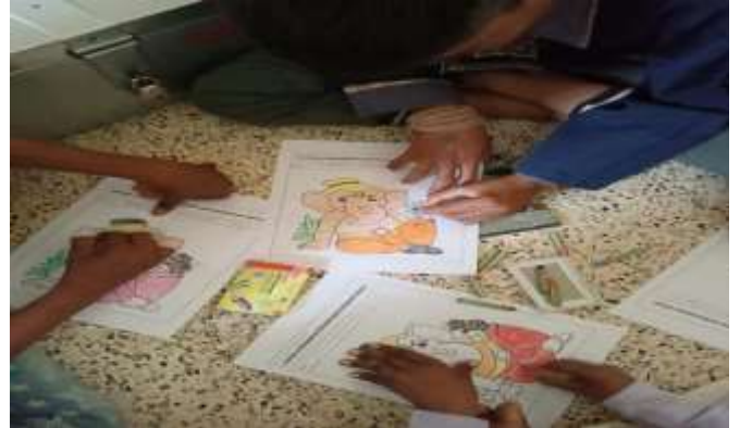
Remarkable drawings made by special kids.