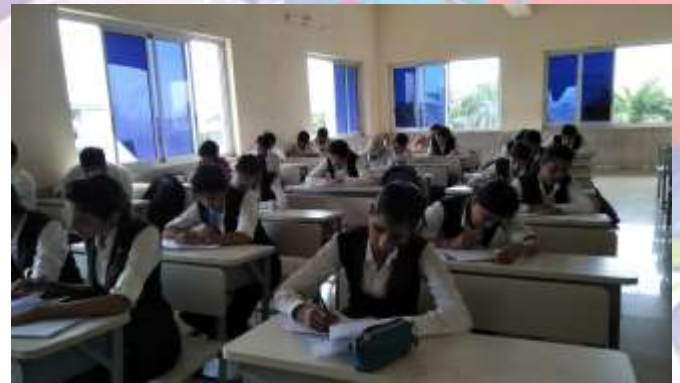
MCA 3 rd year and Integrated MCA final year students participated in aptitude test.

Even students conducted few seminars on the topic and shared their knowledge with others. This was great activity by Training and placement department through which students were able to enhance their problem solving abilities and improve their technical skills.