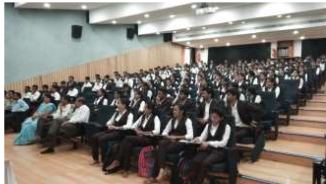
Students participated in seminar