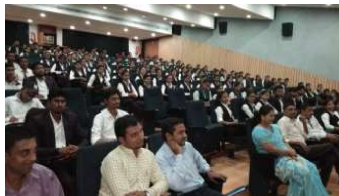
Students and faculties attended the seminar