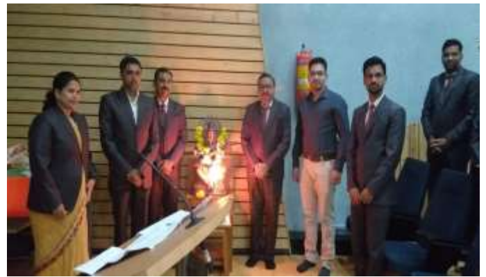
Lightning of lamp by all dignitaries.