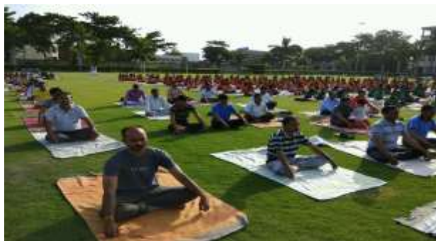
Meditation by faculties during the yoga day.