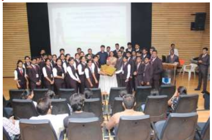
Second year MMS students with dignitaries