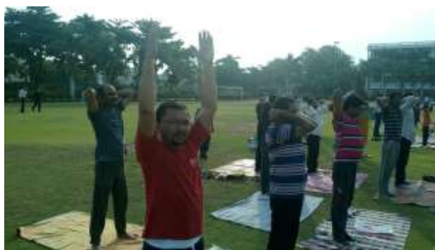
IMRD faculties learning different types of Asana.