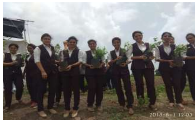
Students enjoying the tree plantation