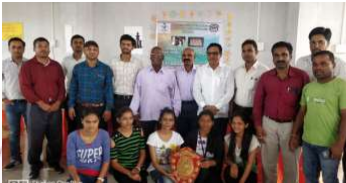
All the winners of chess competition awarded with Trophy and Certificates.