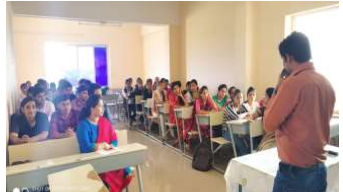
Students participated in the event.