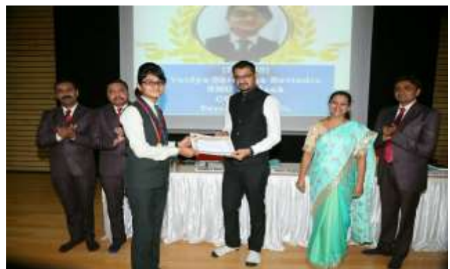
Prize distribution to meritorious students by the dignitaries.