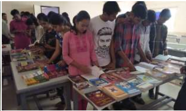
Book exhibition organized by library department on the occasion of Birth anniversary of Dr. Sarvepalli Radhakrishnan.