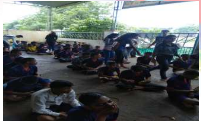
Students serving food to orphanages.