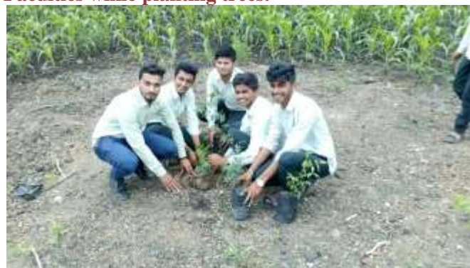
IMCA Students participated in tree plantation activity.